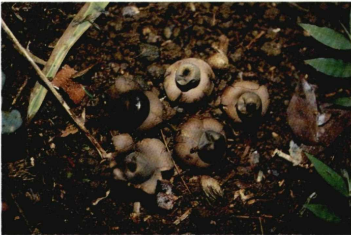
Fig. 3. Bovista reunionis (holotype). – Fig. 4. Geastrum lloydii (WU 25493). – Fig. 5. G. lloydii (WU 23994). – Phot. INGRID HAUSKNECHT.