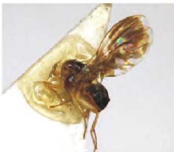
c. Oxyaciura xanthotricha (Bezzi)