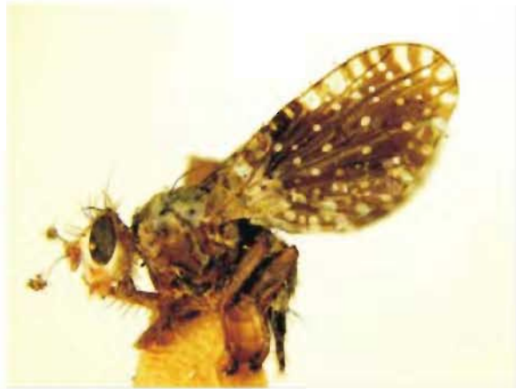
d. Campiglossa cribellata Bezzi