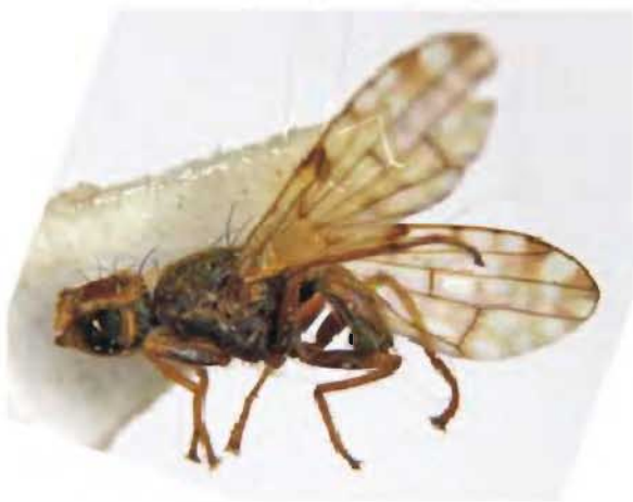
f. Dioxyna sororcula (Wiedemann)