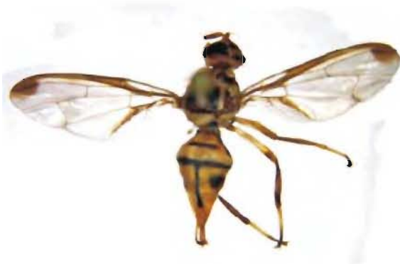
b. Bactrocera (Zeugodacus) tau (Walker)