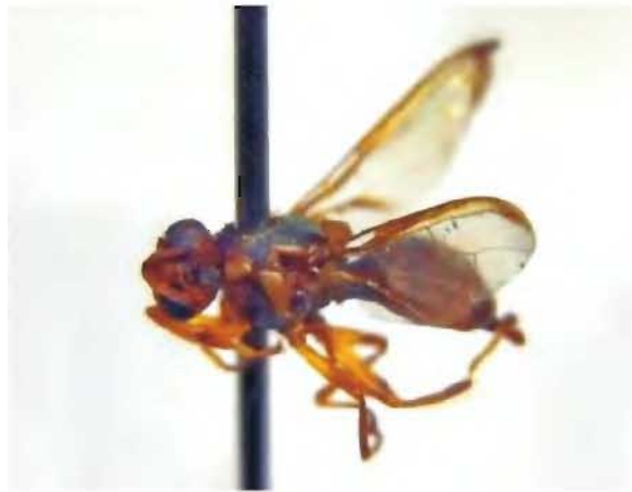
a. Bactrocera (Zeugodacus) scutellaris (Bezzi)