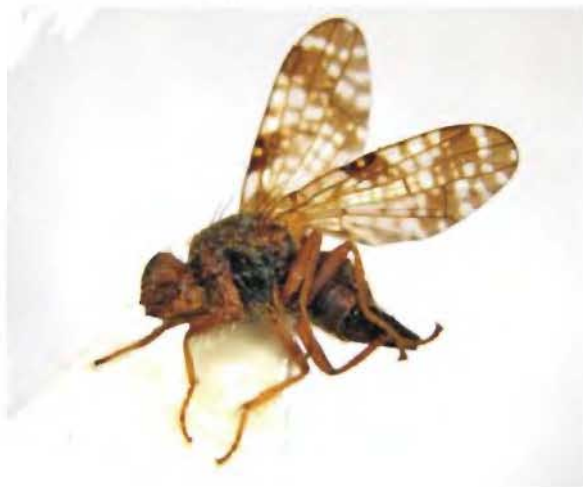
e. Campiglossa gemma (Hering)