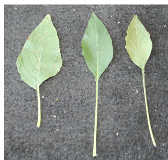
Figure 10: Palmer amaranth (two right) petioles are as long or longer than the leaf length. Redroot pigweed (left) petioles are shorter than its leaves.