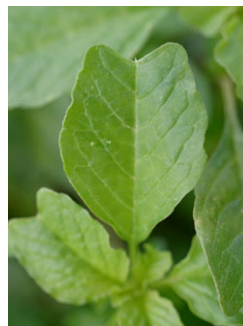
Figure 7: Prostrate pigweed has much smaller leaves that most often have a significant notch at the tip.