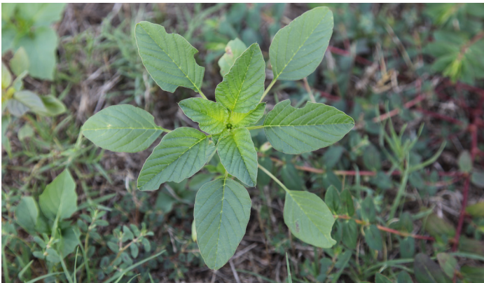
Figure 5: Palmer amaranth leaf arrangement is "poinsettia-like" to optimally expose leaves to sunlight.