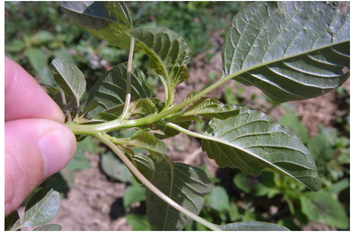
Figure 11: Palmer amaranth has smooth shiny stems.