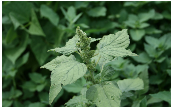
Figure 9: Redroot pigweed usually displays a bumpier surface and prominent veins.