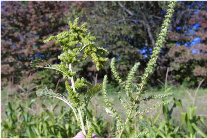
Figure 12: Redroot pigweed (left) has much more compressed flowers than palmer amaranth (right).