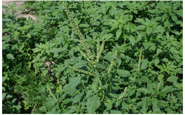
Figure 6: The inflorescence of palmer amaranth, whether male or female is very long.