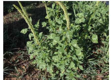
Figure 8: Palmer amaranth may have white watermarks on the leaves. This is not as common on other Amaranthus species but should not be used for identification.