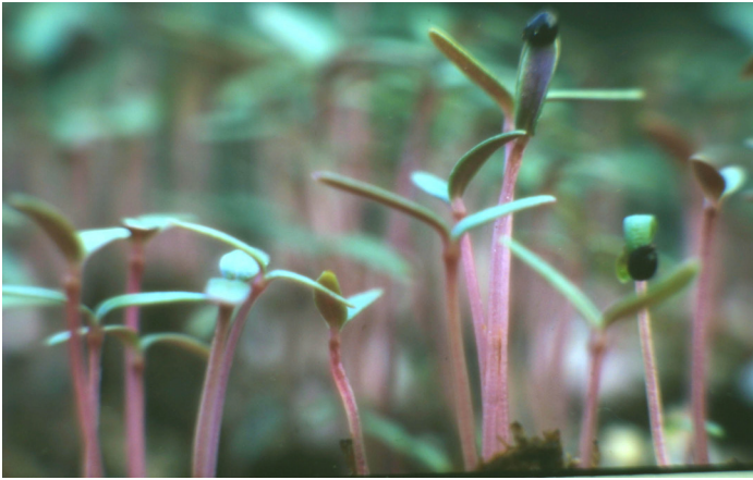
Figure 4: Palmer amaranth seedlings are small due to the small seed and the cotyledons are very long and narrow.