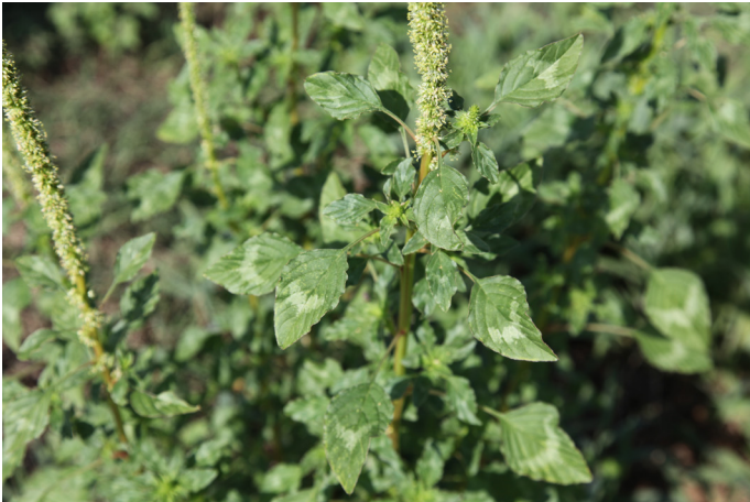
Figure 1. Palmer amaranth is a future threat to Wyoming agriculture.