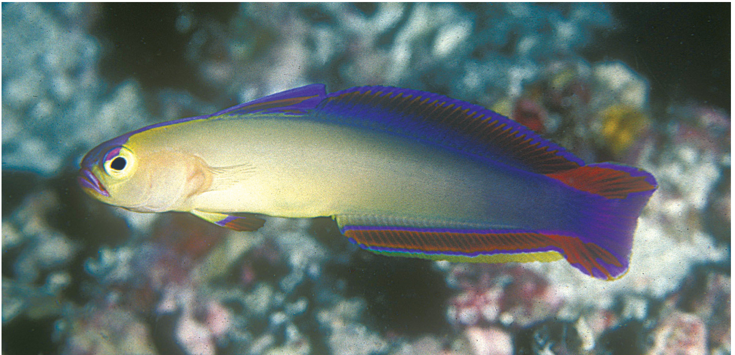
Figure 12. Nemateleotris decora x exquisita , probable hybrid, North Malé Atoll, Maldive Islands (J.E. Randall).

Probable Hybrid. The first author took an underwater photograph of an individual of Nemateleotris in the Maldive Islands in 1988 (Fig. 12) that was first identified as N. decora . However, it is now believed to be the hybrid, N. decora x N. exquisita . The relatively deep body and relatively long snout favor N. decora , whereas the small eye suggests N. exquisita . The pale coloration of the anterior part of the body is clearly neither white or yellow, but yellowish, and the transition of the anterior pale and dark posterior part of the body seems intermediate. With N. decora presently known westward only to Sulawesi and Bali, and N. exquisita east to the Thai coast of the Andaman Sea, one might expect hybridization could occur at some intermediate sites such as Sumatra. Because of its deep-reef habitat and being difficult to collect, we do not know the definitive distribution of N. exquisita . It might range to Sri Lanka like such species as Chaetodon andamanensis and Halichoeres timorensis and stray to the Maldives. Or it might be a valid undescribed species of the genus, paralleling the example of the newly described Coris latifasciata from the Maldives and the Chagos Archipelago, intermediate to the Pacific and Andaman Sea Coris batuensis and the Red Sea Coris variegata (Randall 2013).