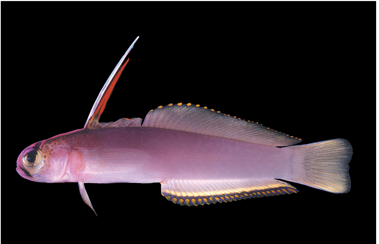
Figure 3. Nemateleotris helfrichi , holotype, BPBM 11595, 43.3 mm, Tahiti, Society Islands.