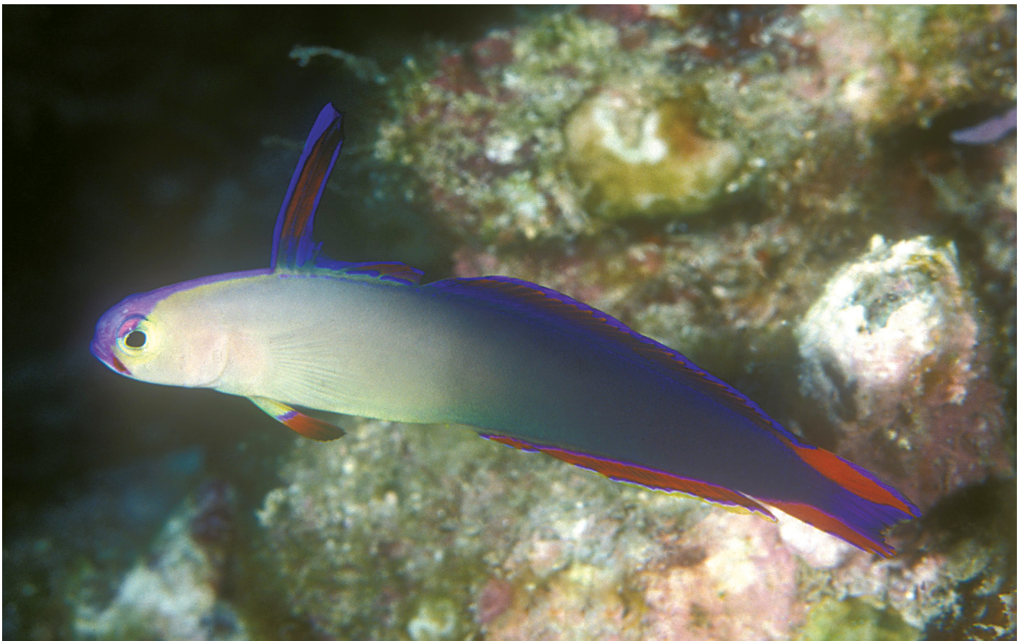
Figure 8. Nemateleotris decora , Bali, Indonesia (J.E. Randall).