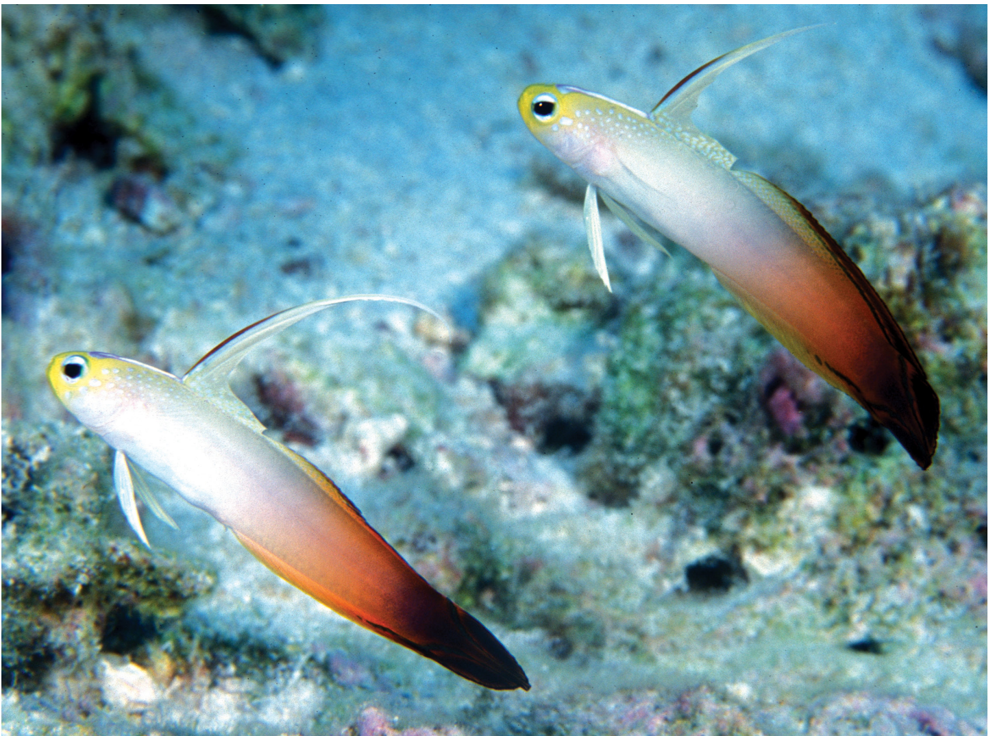
Figure 2. Nemateleotris magnifica , Johnston Island.