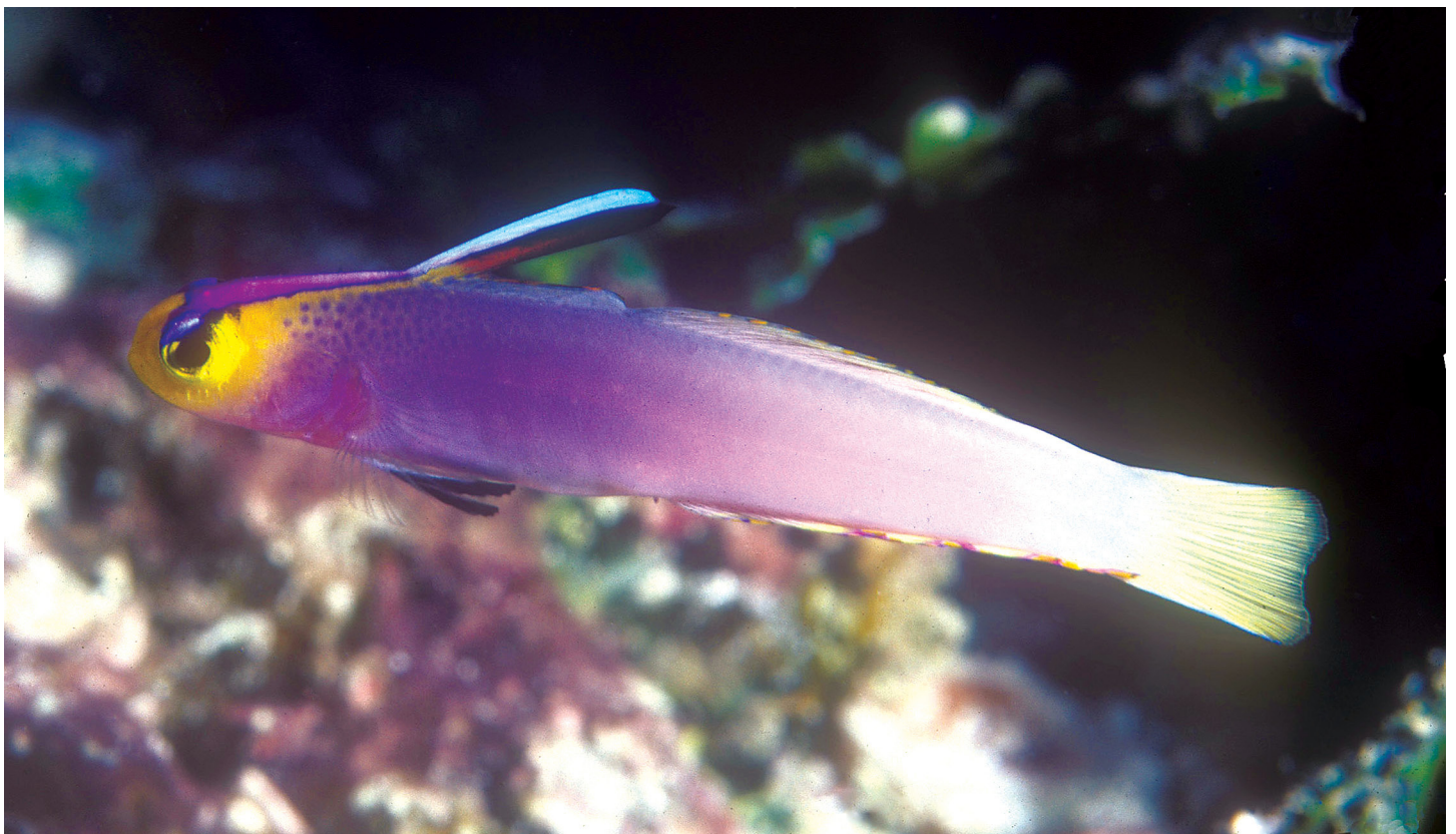
Figure 4. Nemateleotris helfrichi , Kwajalein Atoll, Marshall Islands (J.E. Randall).