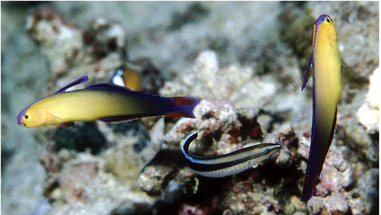
Figure 10. Nemateleotris exquisita , a pair with Labroides dimidiatus , 69 m, Daedalus Reef, Egypt, Red Sea.

pink line separating the two zones, the ray tips blackish; a short narrow black band on maxilla below eye. Largest specimen, 66 mm SL.