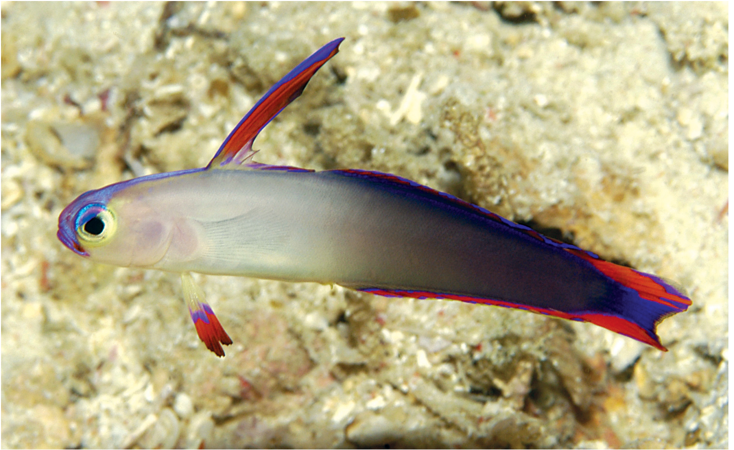
Figure 7. Nemateleotris decora , Raja Ampat, Papua (G.R. Allen).