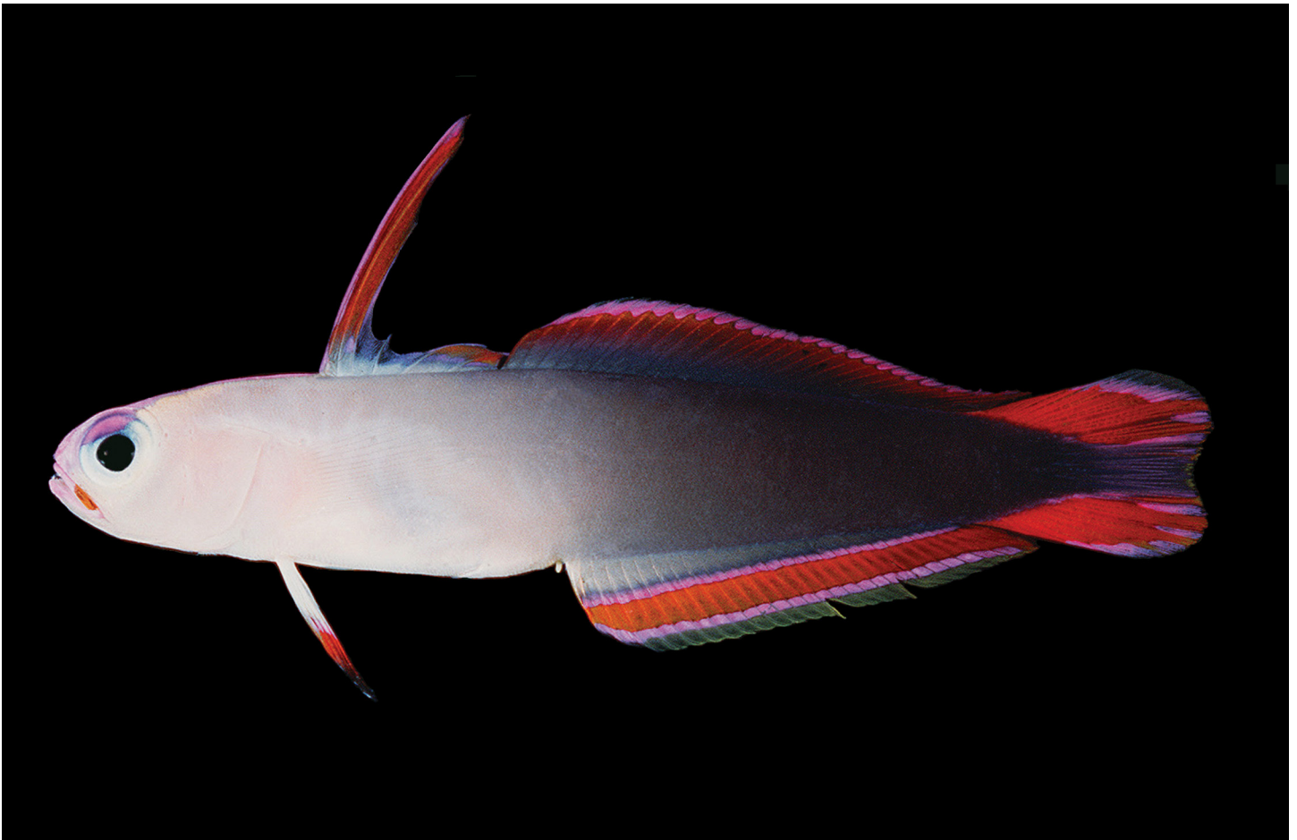
Figure 5. Nemateleotris decora , holotype, BPBM 9533, 34 mm, Palau, Micronesia (J.E. Randall).