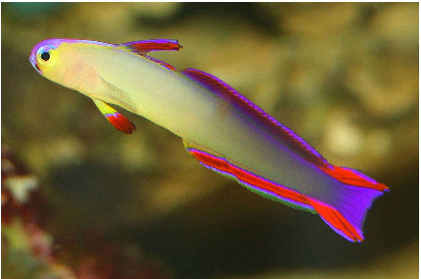
Figure 11. Nemateleotris exquisita , aquarium photograph.

Distribution. Nemateleotris exquisita is presently known from Mauritius, KwaZulu-Natal, southern Mozambique, Red Sea, Thai coast of the Andaman Sea, and the Andaman Islands. Nemateleotris decora is known in Indonesia from Sulawesi (Severns 1994: 70) and by the first author's underwater photographs from Halmahera, Moyo Island, and Bali. It is also illustrated from Christmas Island (Allen & Steene 1988: 141, fig. 428).