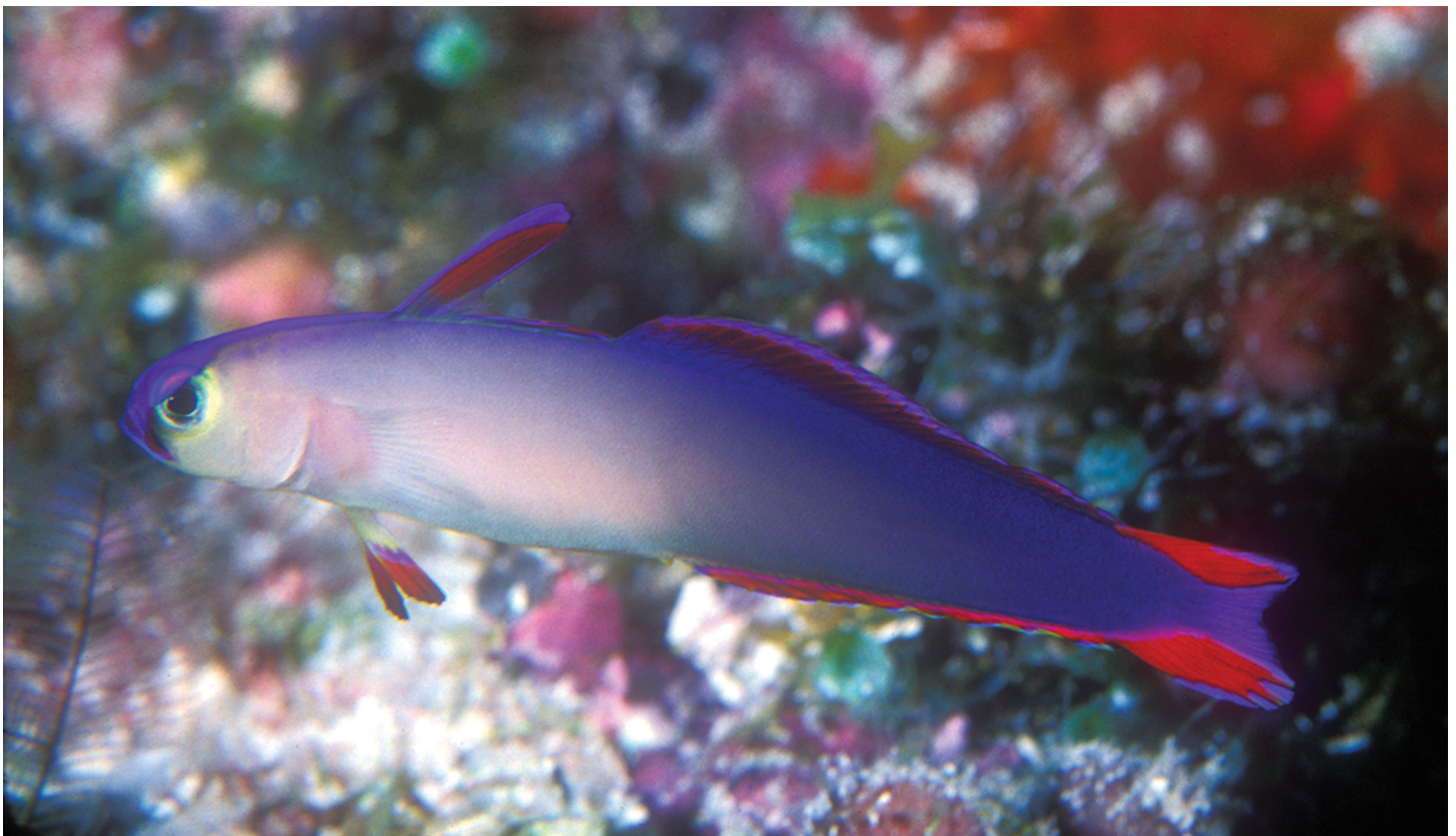
Figure 6. Nemateleotris decora , Halmahera, Indonesia (J.E. Randall).