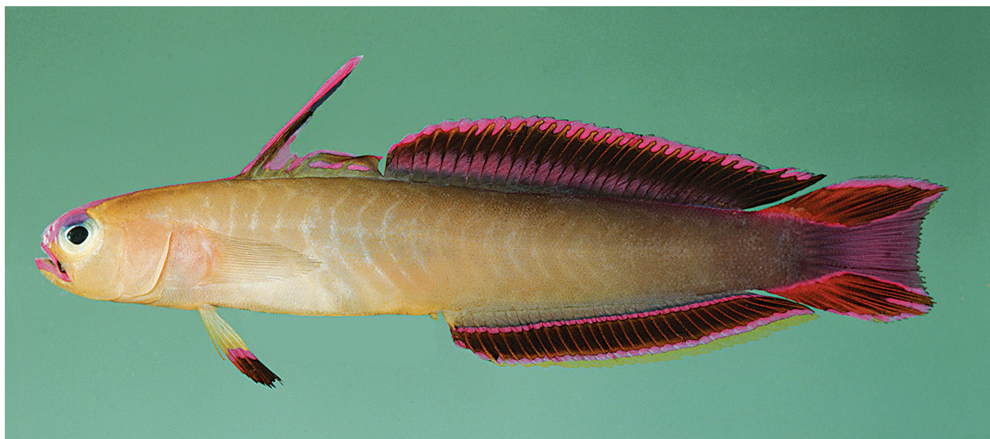
Figure 9. Nemateleotris exquisita , holotype, BPBM 16173, 60.5 mm SL, Mauritius, 56 m (J.E. Randall).

Diagnosis. Dorsal rays VI + I, 30–33; anal rays I, 30–32; pectoral rays 20 or 21 (usually 21); longitudinal scale series 163–195; all scales cycloid (none or very few cteni on posterior body scales); gill rakers 5 or 6 + 14–17; body elongate, the depth 5.7–6.3 in SL; head length 4.7–4.95 in SL; snout length 3.95–4.65 in head length; orbit diameter 3.1–3.7 in head length; first dorsal spine 3.9–4.3 in SL; caudal fin slightly emarginate to nearly truncate; color in alcohol uniformly pale beige with a blackish dash mark on side of maxilla below eye and dark brown tips on pelvic fins; body in life yellow to white anteriorly (usually yellowish), grading to dusky deep purple well posterior to origin of anal fin; lips, snout, interorbital, dorsoanterior edge of eye, and a narrowing medial band on nape varying from bright pink to purple, this color continuing on margins of dorsal fins and upper and lower margins of caudal fin; broad central part of caudal fin purple, grading basally to body color, the lobes orange-red streaked with black; dorsal and anal fins with a broad deep red stripe edged in purple, the anal fin margin green; pectoral fins translucent; pelvic fins colored like body on basal half, orange-red on outer half, with a purple to