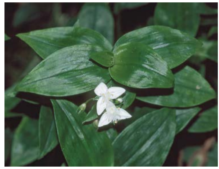
Tradescantia fluminensis Stokes Valley.

This species needs little introduction or explanation, every gardener or nature lover who has ever encountered it, will share the same view, it's painful! It must be said the survival of Tradescantia is because of its incredible ability to form mats of fleshy stems. Interestingly, this species does not seed in the New Zealand environment, so spreads only vegetatively, which means it is usually only found where some bright spark has dumped garden waste. This pestilent menace of a plant is only where we have put it, so some consideration would go a long way in preventing its further spread. I will leave it to the voters to express their thoughts: