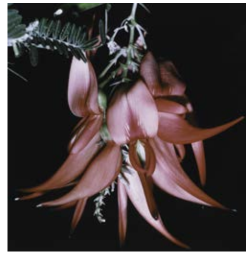
Clianthus puniceus in cultivation.

In third place was the iconic and endangered kakabeak ( Clianthus puniceus ). This species garnered 4.8% of the vote and has featured eight times in the top 10, the last appearance being 2017. Needing little explanation as it sits clearly in most New Zealander's minds with its superb brightly coloured flower panicles. Thought to have only been found naturally in Northland and the Auckland portion of the Hauraki Gulf, it was once a feature in many garden centres until being replaced by it close relative C. maximus . In 2005 there was thought to be just one surviving natural specimen in the Kaipara Harbour area making this species "Threatened – Nationally Critical", and realistically possible of going extinct in the wild. The passionate supporters of this species had this to say: