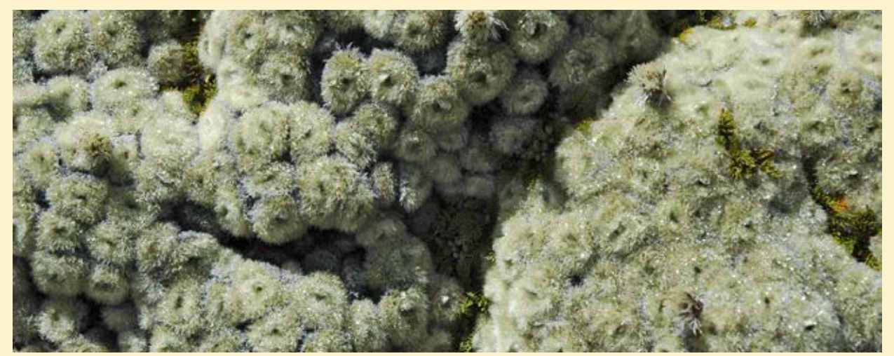
Haastia pulvinaris var. pulvinaris.

The plant of the month for January is Haastia pulvinaris , one of three Haastia species, all endemic to New Zealand. The species is adapted to very exposed habitats in the mid to high alpine zone. It is often found near high rocky ridges, often just over the shaded side on stable scree, and on rock outcrops, growing out of cracks. It is found in the drier eastern areas of the northern South Island from the Richmond Ranges, near Nelson, to north Otago. Individuals form large dense clumps or cushions, totally covering the ground surface for up to a few square metres area. The leaves are very reduced in size and packed in uniform round rosettes that look like little cylinders, very similar in form to those of the vegetable sheep, Raoulia spp. Single yellow or whitish composite flowers emerge from the top of each rosette. These have very reduced ray florets and are in the form of small buttons. The species is split into two varieties, var. pulvinaris and var. minor , which differ in their rosette diameter and tomentum colour. Haastia pulvinaris var. minor has a whiter tomentum and smaller rosettes (<15 mm diameter).