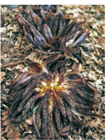
Dactylanthus taylorii female inflorescence.

Dactylanthus taylorii is a threatened species, described as "Threatened - Nationally Vulnerable" (de Lange et al., 2013). Dactylanthus taylorii is a unique endemic in New Zealand: it is our only member of the family Mystropetalaceae; it is our only fully parasitic flowering plant; it lacks chlorophyll; and it is dioecious with an approximate 5:1 male bias just to make reproduction and survival that much more challenging. The plant grows in the form of a rhizome, which is mostly buried just below the surface making it very cryptic until in flower. The 'flowers' appear only for a few days, although a single rhizome can produce up to 60 inflorescences a season. The female inflorescences slightly resemble a ground dwelling tarantula spider with mostly dark brown scaly fleshy stalks known as spadices that bear simple flowers. The male flower, also very simple in structure, produces a huge amount of squalene rich nectar in an attempt to attract an animal pollinator. The known targeted pollinator of D. taylorii is the short-tailed bat, which is also an endangered species, causing a somewhat limited potential for pollination. Because of the low growth habit of D . taylorii, it has become a favourite food of ship rats and possums that are not known to perform any