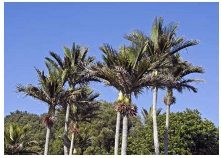
Rhopalostylis sapida at Whareroa Farm, Paekakariki.

The 2017 runner up, the iconic nikau palm (Rhopalostylis sapida) garnered 8.1% of the vote; it was making its fourth appearance in the top 10 last featuring in 2007. This grand plant is one New Zealand's two species of palm, the other being the arguably distinct Kermadec nikau. Nikau may grow as tall as 15 m and is usually found in lowland coastal areas, often where humidity is higher beside the plane of a river valley, or stream. This iconic species is known to most New Zealanders and has been immortalised as steel sculptures at the entry to Wellington's civic square. The supporters of this species had lots and little to say: