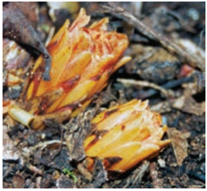
Dactylanthus taylorii male inflorescences.