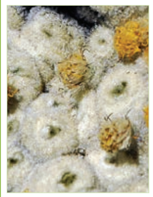
Haastia pulvinaris.