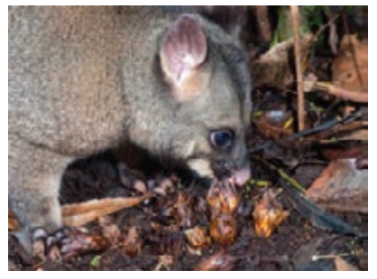
Dactylanthus taylorii being fed on and predated by common brushtail possum—Trichosurus vulpecula.