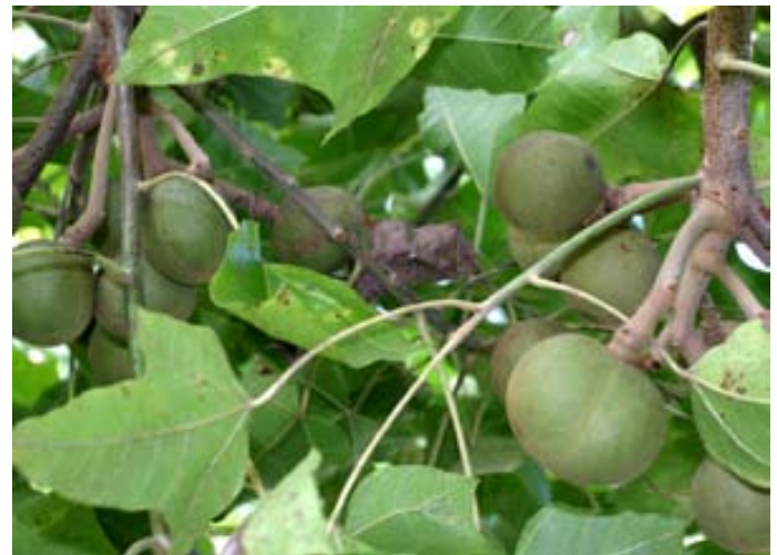
Upper left: The scientific name for kukui, Aleurites , comes from the Greek word for “floury,” referring to the dusted-flour appearance of young leaves and flower buds. Upper right: Trees often flower nearly continuously. Lower right: Ripe fruit in tree. Lower left: Bark is smooth and light gray in color, often with lichen growth in moist areas.

leaf base and petiole that secrete a sweetish sap. Leaves of young plants and those of the lower branches are three- to five-lobed with a rounded, heart-shaped base (subcordate), while the apex is acute (sharp). Younger leaves are usually simple and deltoid to ovate in shape. The upper surface of young leaves is whitish with a silvery gloss, becoming dark green with age. The underside is rusty stellate-pubescent when young (having a hairy glossy indument).