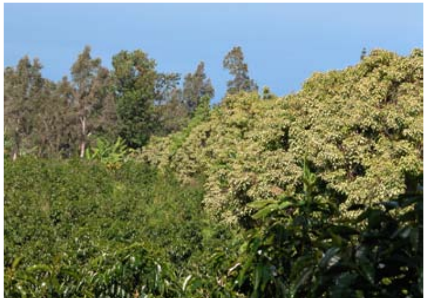
Kukui makes an excellent screen along roads and boundaries. Top: Privacy hedge along driveway. Bottom: Boundary hedge next to coffee plantation.