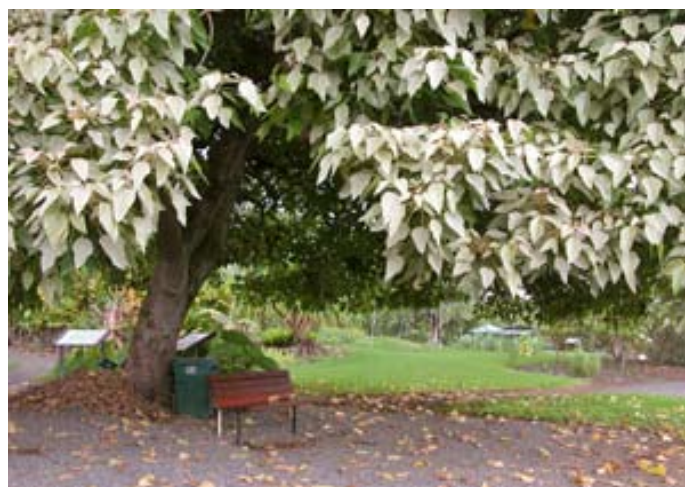
Left: In open areas, the foliage usually extends down to the ground. Right: When pruned up, the area under the canopy makes a wonderful sitting area.