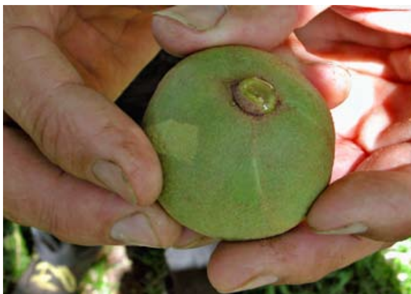
Top: The kukui kernel has numerous uses including medicine, condiment, and a basis for oil and soap. Bottom: The sap which wells up at the stem attachment just after harvesting young kukui fruits is used traditionally by Hawaiians to treat cuts and skin sores.