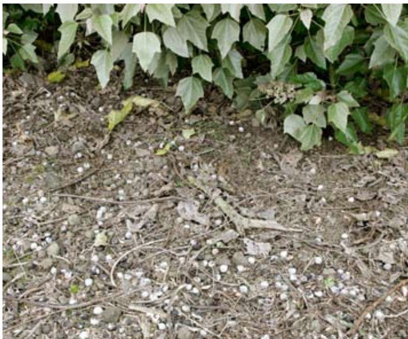
Ripe fruit can often be collected from underneath the lower canopy (top), or seeds can be collected from the ground under trees with the husk already deteriorated (bottom).