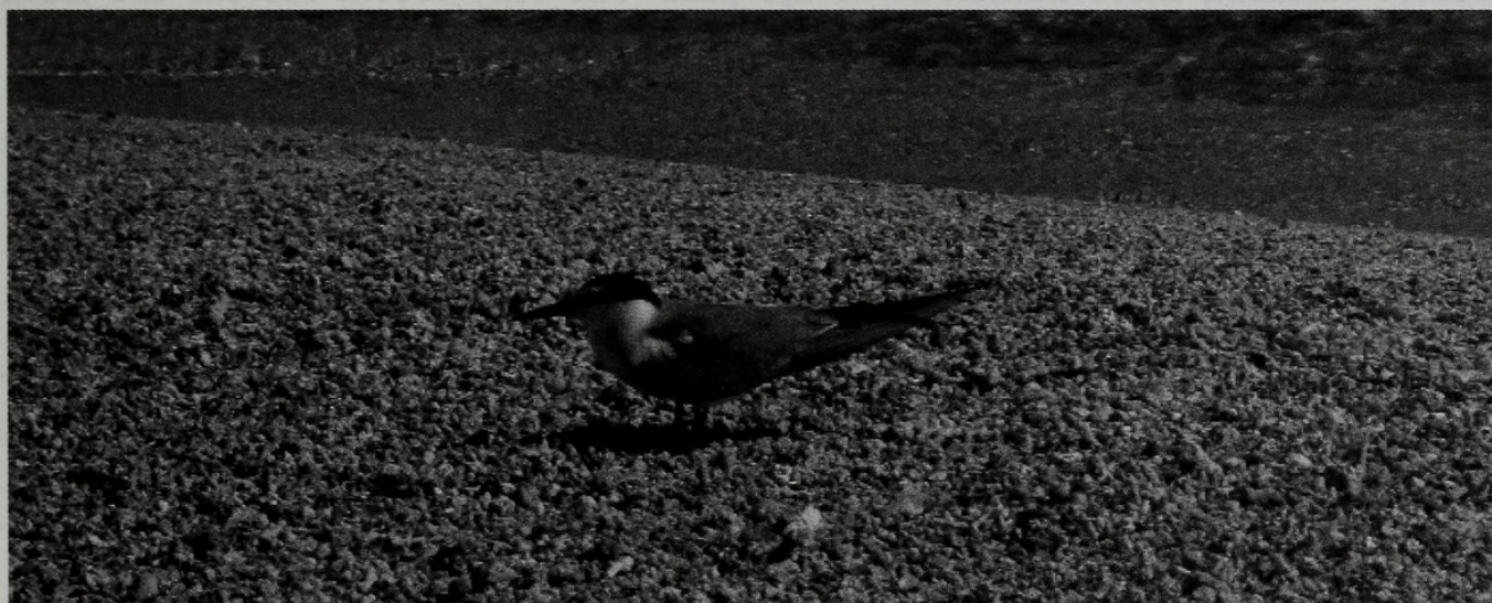
Figure 3. Grey-backed Tern Sterna lunata , Satawan Atoll, 28 June 2004 (D. W. Buden)

Vagrant or occasional visitor. Breeds in Micronesia only in the Mariana Islands, but the species has been recorded in Palau, Yap and the Marshall Islands (Wiles 2005). One that I photographed (Fig. 3) on a sand and gravel bank on the east side of Satawan Atoll on 28 June 2004 is the first record for any of the eastern Caroline Islands (i.e. Chuuk, Pohnpei and Kosrae states), although Baker (1951) reported that W. Coultas obtained an immature male at sea south-east of Pohnpei in October 1930. The pale grey mantle of the Satawan bird distinguished it from the darker plumaged Bridled Tern Sterna anaethetus , which may also occur as a vagrant.