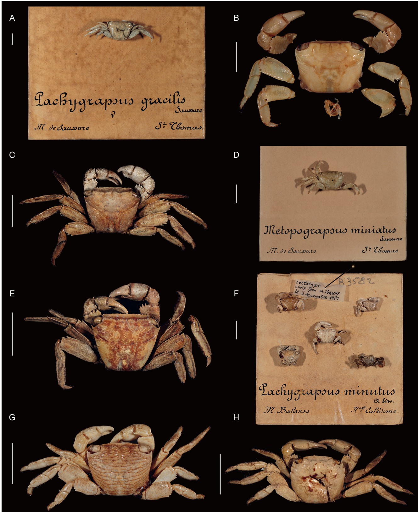
FIG. 7. – A , Metopograpsus gracilis Saussure, 1858, MNHN-IU-2000-10991 (= MNHN-B10991), paralectotype, ♀; B , Metopograpsus intermedius H. Milne Edwards, 1853, MNHN-IU-2014-11210 (= MNHN-B12888), lectotype, ♂; C , Metopograpsus maculatus H. Milne Edwards, 1853, MNHN-IU-2000-3554 (= MNHN-B3554), lectotype, ♂; D , Metopograpsus miniatus Saussure, 1858, MNHN-IU-2000-10994 (= MNHN-B10994), paralectotype, ♂; E , Metopograpsus pictus A. Milne-Edwards, 1867, MNHN-IU-2000-3573 (= MNHN-B3573), paralectotype, ♂; F , Pachygrapsus minutus A. Milne-Edwards, 1873, MNHN-IU-2000-3582 (= MNHN-B3582), lectotype, ♂, & MNHN-IU-2000-1107 (= MNHN-B3582), paralectotypes, 4 ♂; G , Pachygrapsus striatus A. Milne-Edwards, 1873, MNHN-IU-2000-3586 (= MNHN-B3586), lectotype, ♂; H , Grapsus varius Latreille, 1803, MNHN-IU-2000-3526 (= MNHN-B3526), neotype, ♂. Scale bars: A, 5 mm; B, D, F, G, 10 mm; C, E, H, 2 cm.