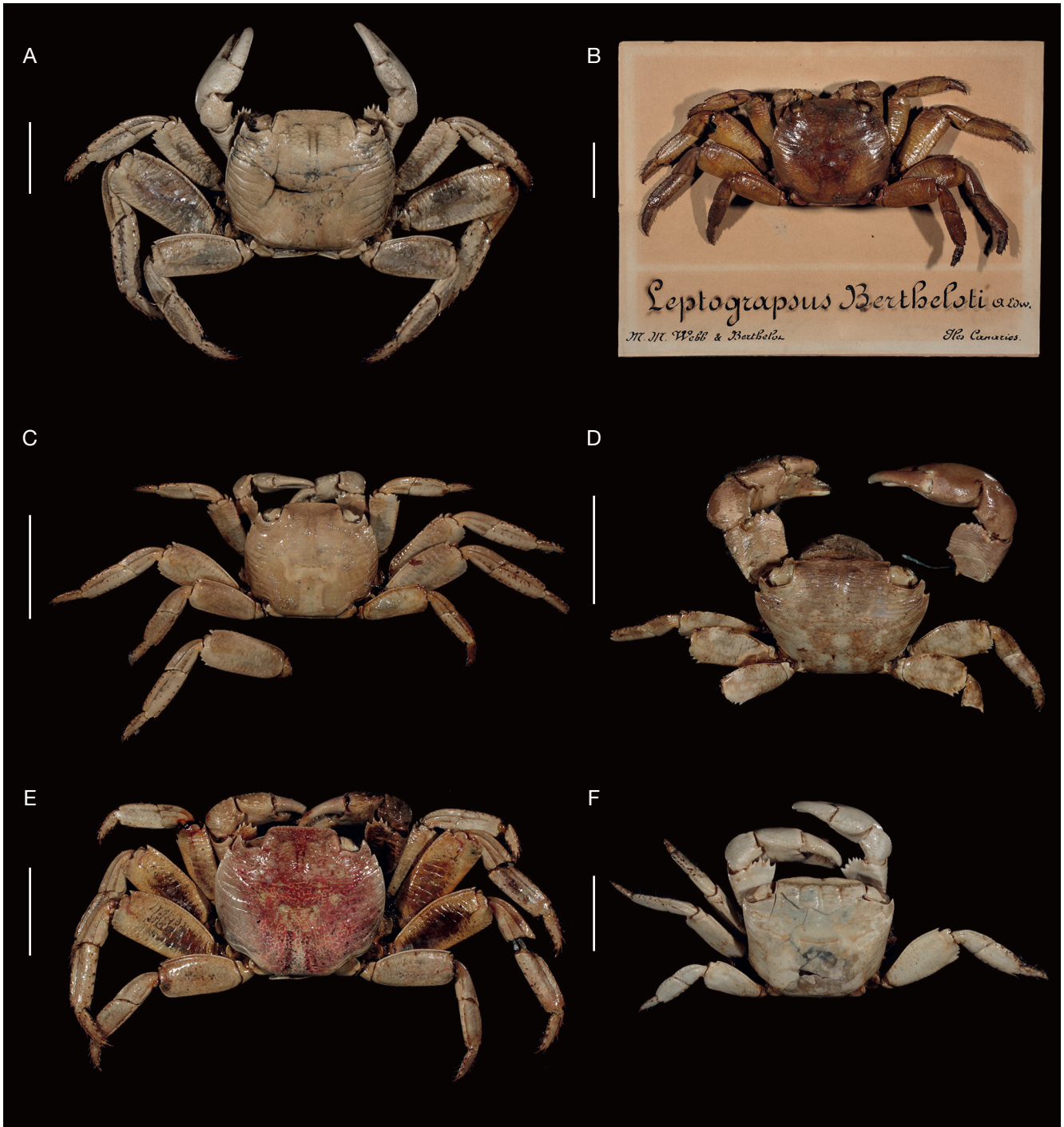
FIG. 6. — A , Leptograpsus ansoni H. Milne Edwards, 1853, MNHN-IU-2000-4023 (= MNHN-B4023), lectotype, ♂; B , Leptograpsus bertheloti H. Milne Edwards, 1853, MNHN-IU-2000-10944 (= MNHN-B10944), lectotype, ♀; C , Leptograpsus gayi H. Milne Edwards, 1853, MNHN-IU-2000-3531 (= MNHN-B3531), lectotype, ♂; D , Leptograpsus rugulosus H. Milne Edwards, 1853, MNHN-IU-2000-3534 (= MNHN-B3534), lectotype, ♂; E , Leptograpsus verreauxi H. Milne Edwards, 1853, MNHN-IU-2000-4024 (= MNHN-B4024), lectotype, ♂; F , Metopograpsus eydouxi H. Milne Edwards, 1853, MNHN-IU-2000-3547 (= MNHN-B3547), lectotype, ♂. Scale bars: A, D, F, 10 mm; B, C, E, 2 cm.