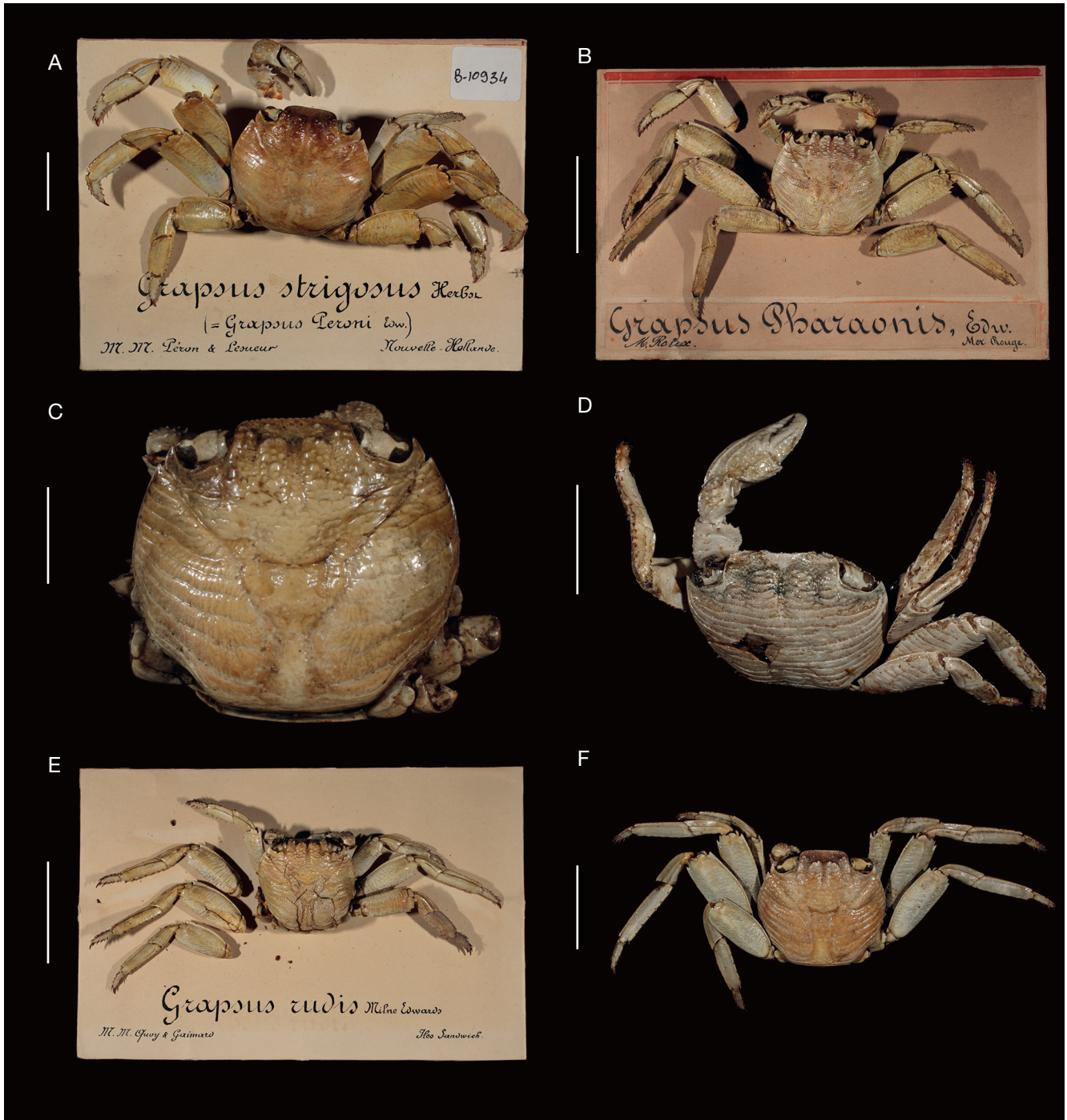
FIG. 5. — A , Grapsus peroni H. Milne Edwards, 1853, MNHN-IU-2000-10934 (= MNHN-B10934), lectotype, ♂; B , Grapsus pharaonis H. Milne Edwards, 1853, MNHN-IU-2000-3439 (= MNHN-B3439), lectotype, ♂; C , Grapsus pictus Latreille 1803, MNHN-IU-2000-3409 (= MNHN-B3409), neotype, ♀; D , Grapsus plicatus H. Milne Edwards, 1837, MNHN-IU-2000-3585 (= MNHN-B3585), lectotype, ♀; E , Grapsus rudis H. Milne Edwards, 1837, MNHN-IU-2000-10875 (= MNHN-B10875), holotype, ♂; F , Grapsus webbi H. Milne Edwards, 1853, MNHN-IU-2000-3457 (= MNHN-B3457), lectotype, ♂. Scale bars: A, F, 2 cm; B, E, 5 cm; C, D, 10 mm.