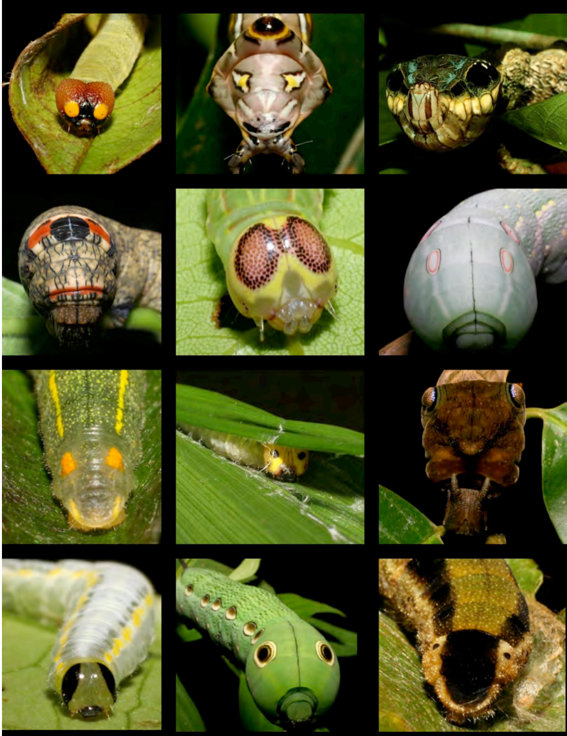
Figure S1. ACG last instar caterpillars displaying false eye spots. See SI Appendix, Table S1 for names and voucher codes.