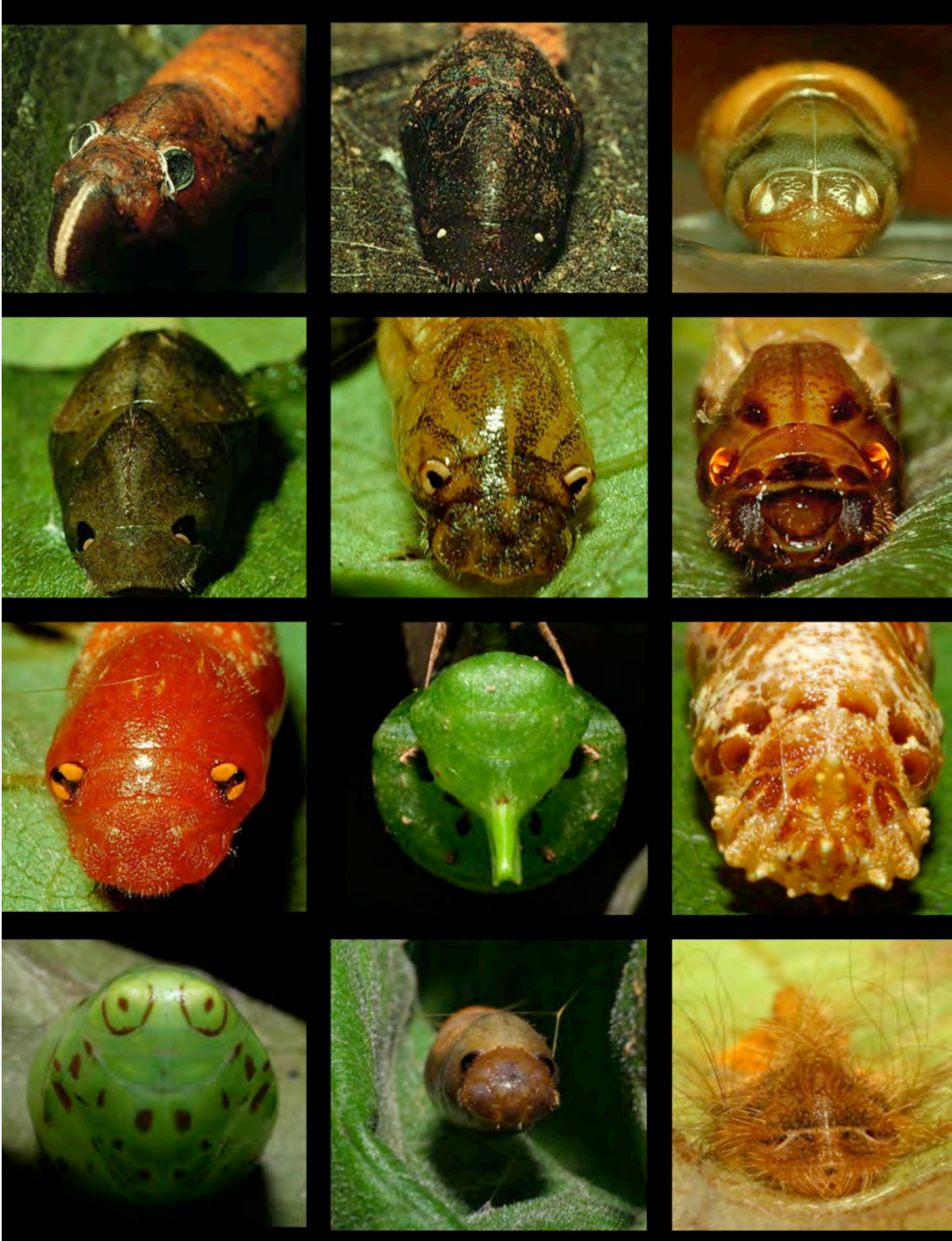
Figure S2. ACG pupae displaying false eye spots. See S1 Appendix, Table S1 for names and voucher codes.