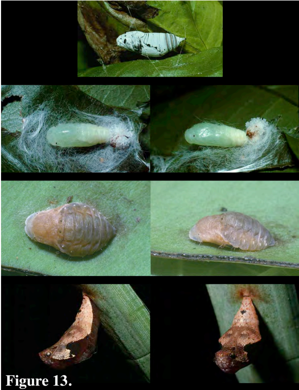
Figure S13. ACG pupae bearing false eye spots but as viewed laterally and dorsally. See SI Appendix, Table S1 for names and voucher codes.