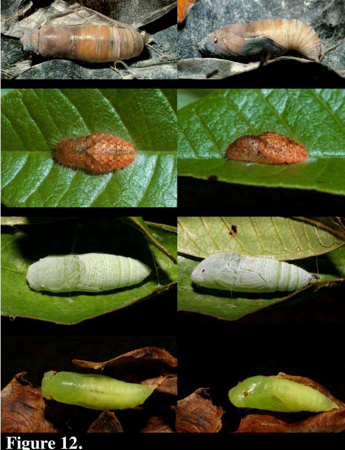
Figure S12. ACG pupae bearing false eye spots but as viewed laterally and dorsally. See SI Appendix, Table S1 for names and voucher codes.