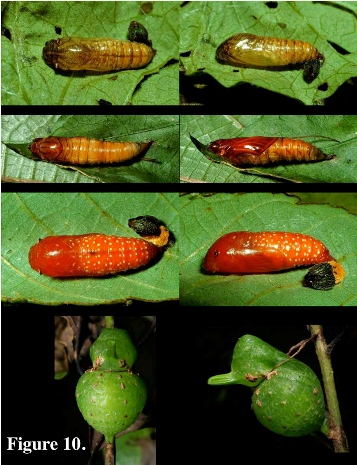
Figure S10. ACG pupae bearing false eye spots but as viewed laterally and dorsally. See SI Appendix, Table S1 for names and voucher codes.