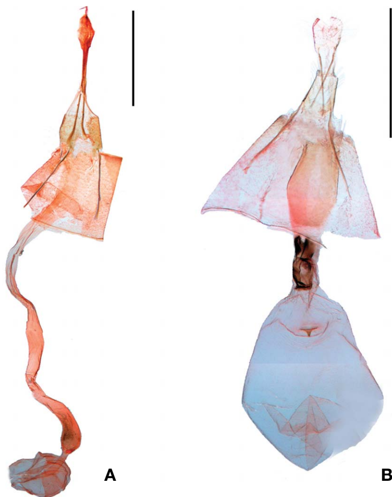
Fig. 3. Female genitalia: A, Diplopseustis perieresalis ; B, Dolicharthria bruguieralis . Scale bars: A, B=1 mm.

Nacoleia ochrimaculalis South, 1901, in Leech, 1901: 460, Pl. 15: 28.