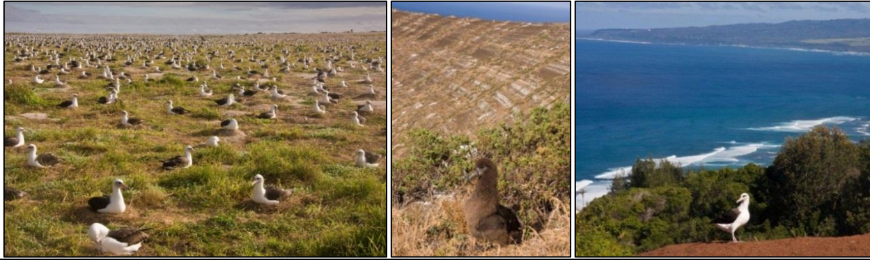
Albatross colonies on low atolls like Midway (left) are vulnerable to climate change and sea level rise; those on high islands like Lehua (center) and Oahu (right) may become more important.

Conservation Actions to Date: The Short-tailed Albatross was listed as endangered under the U.S. Endangered Species Act (ESA) in 2000 (USFWS 2008). The USFWS was petitioned in October 2007 to list the Black-footed Albatross under the ESA, but the USFWS determined in October 2011 that listing was not warranted.