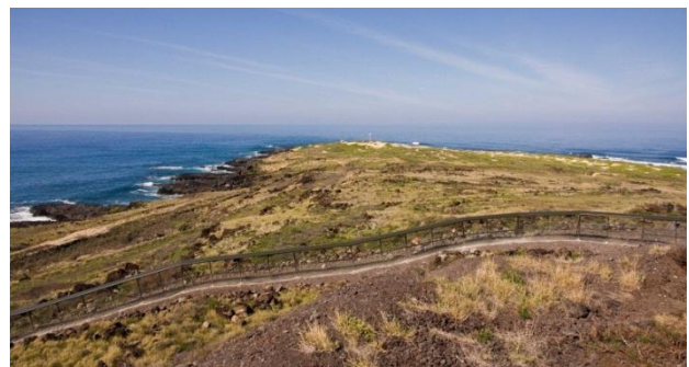
Predator fence, Kaena Pt., Oahu.