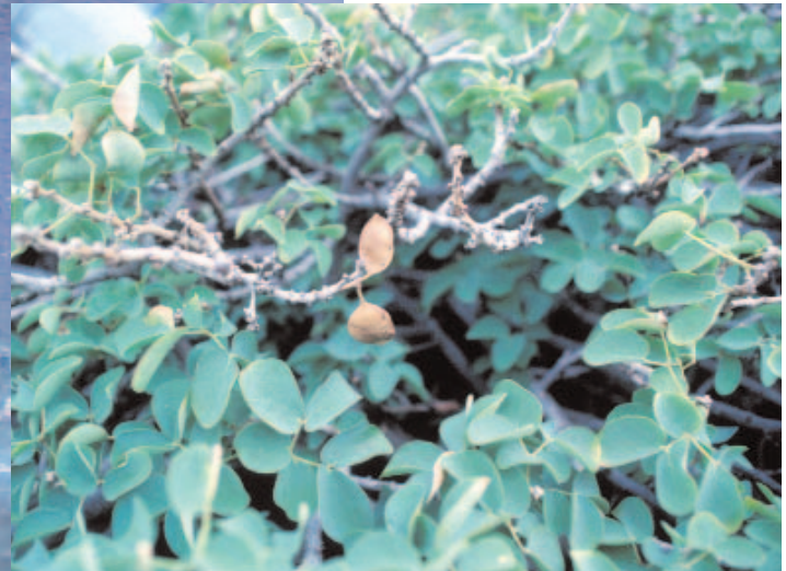
Figure 10. Discovered in 1992, Kanaloa kahoalawensis survived possible extinction by growing on an ungulate-inaccessible seastack along the coast of Kaho'olawe.

roducing native invertebrates and birds. Those studies will help create a restoration plan that could determine the course of the island's ecological recovery over the next 50 to 100 y. The first priority is to stop erosion of certain areas. The restoration of Kaho'olawe is a monumental undertaking and will serve to guide other large-scale restoration projects in the state.