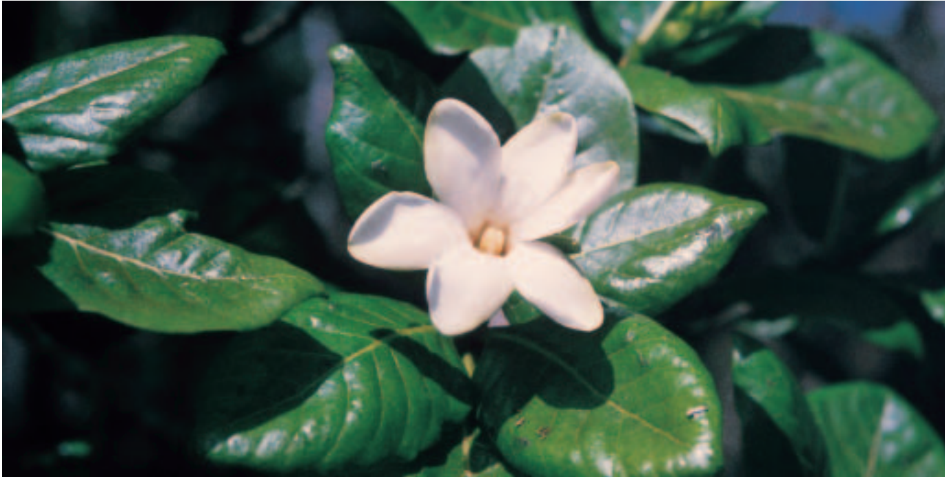
Figure 6. Hawaiian gardenia ( Gardenia brighamii ).

especially with Lānaʻi sandalwood. During the past few drought years, however, rats have disappeared from the lower elevations on the preserve, and natural seedling recruitment of this species has increased.