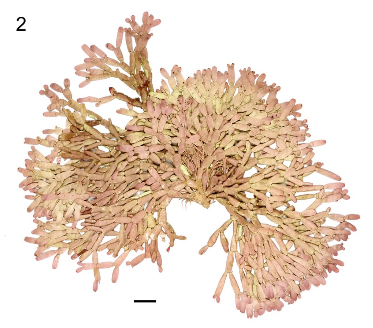
Fig. 2. Dichotomaria major (Decaisne) Huisman & Guiry. Epitype specimen from Rottnest Island, Western Australia ( PERTH 08829020). Scale bar = 1 cm.