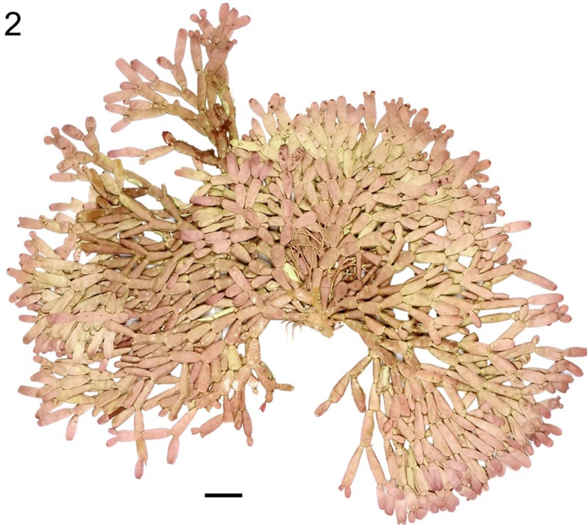
Fig. 2. Dichotomaria major (Decaisne) Huisman & Guiry. Epitype specimen from Rottneest Island, Western Australia (PERTH 08829020). Scale bar = 1 cm.