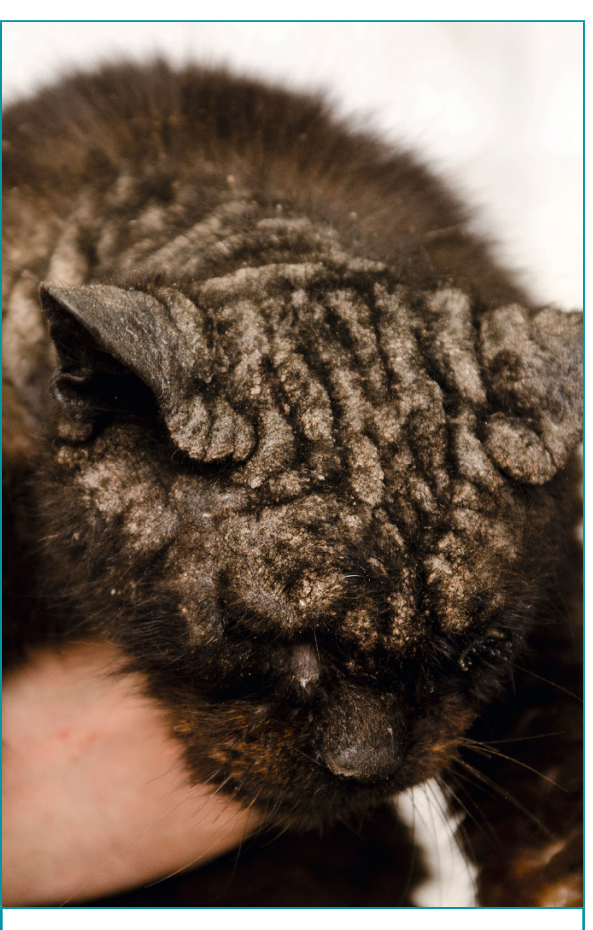
Fig. 2 Cat showing severe notoedric mange symptoms