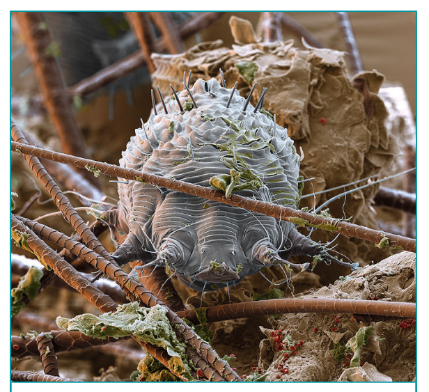
Fig. 1 Scanning electron micrograph of an adult Notoedres cati mite among hair and skin debris

Notoedric mange caused by the mite Notoedres cati (Astigmata: Sarcoptidae) (Fig. 1) is a cutaneous ectoparasitic disease of mammals. This disease often affects domestic cats (Felis catus), wild cats and more rarely it has become a major disease among wild animals in captivity and natural reserves (Valenzula et al. 2000). The condition is highly contagious and primarily occurs by direct contact between animals or by contact with infested bedding or sites recently visited by infested animals. The clinical manifestation is, as in scabies, characterised by intense pruritus, hyperkeratosis, peeling skin and lesions, especially on the face and the ears (Friberg 2006), extending to the neck, limbs and other body areas in the case of massive infestation (Fig. 2). The clinical symptoms are often