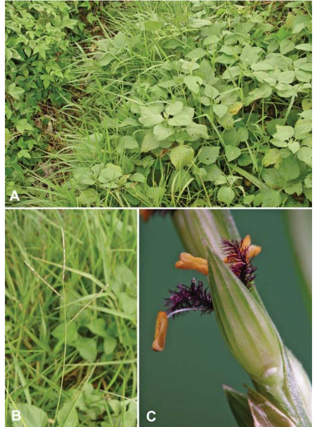
Fig. 2. Urochloa glumaris (Trin.) Veldkamp. A, its natural habitat; B, the inflorescence; C, spikelet with an open upper flower.

Specimens examined: TAITUNG: Lanyu, Mar. 24, 1975, C.E. Chang 8082 (TAI); Hsiaoyehliu, Jan. 20, 1995, J.S. Wu 5-047 (TNM); Hsiaoyehliu, Sept. 9, 2004, C.L. Huang 337 (TNM); Lanyu, Mar. 28, 2005, C.L. Huang 431 (TNM).