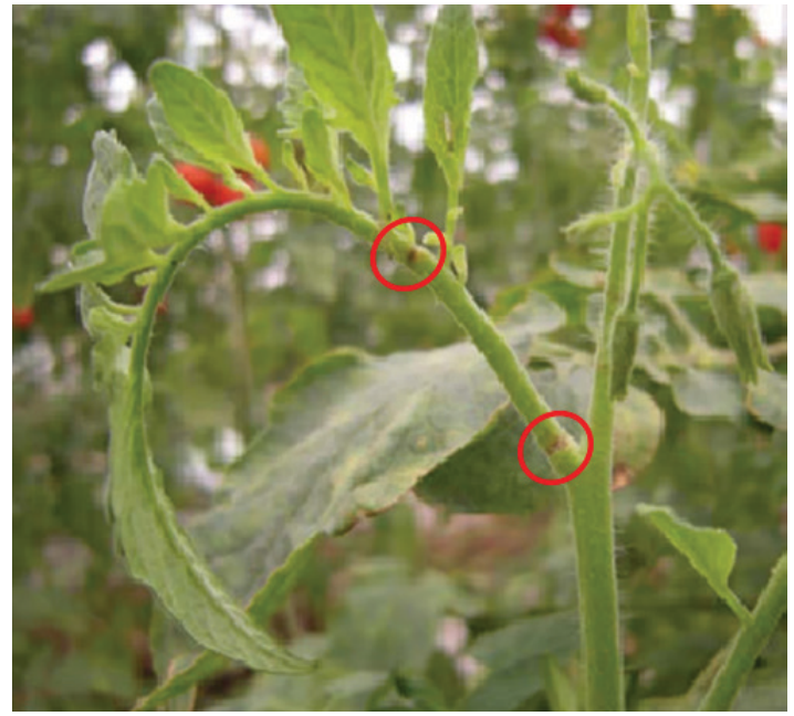
Figure 3. Tomato plant damage caused by feeding on stems and petioles.