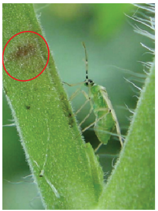
Figure 2. Brown ring formed by feeding of Nesidiocoris tenuis on a tomato plant.