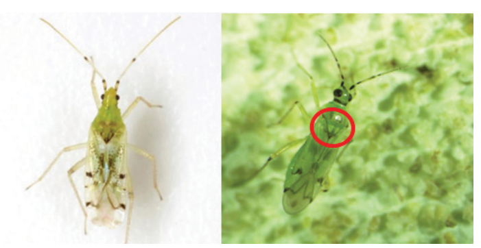
Figure 6. Presence and absence of black band behind the eyes. Left ( Macrolophus brevicornis Knight).

The adult of Nesidiocoris tenuis is green in color and varies from 6 -10 mm in length (Sylla et al. 2016). The body is elongated and slender, antennae are pale brown. The female is larger than male and has a more rounded oval shape body (El-Dessouki et al. 1976, Kim et al. 2016). What differentiates this species from other mirids is the black band at the back of the eyes. In the genus Macrolophus , the black band is absent (Figure 6).