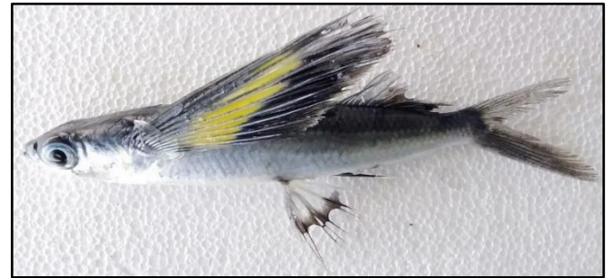
Figure 1. Cheilopogon spilopterus

Maximum standarard length 25 cm. Pelagic fish on the surface close to the coast and neritic. Distribution of this type of fish in the East Indian Ocean and Western Pacific [7].