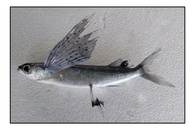
Figure 2. Cheilopogon abei

Maximum standard length is 22 cm. Pelagic fish on the surface close to the coast and neritic. Distribution of this type of fish in the Indian Ocean and West Pacific Ocean [7].