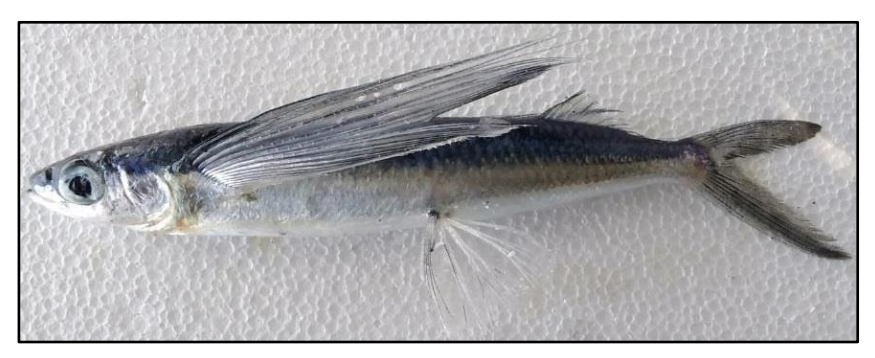
Figure 4. Hirundichthys oxycephalus

The maximum standard length is about 18 cm. Pelagic in nearshore and neritic surface waters. It is a small pelagic fish that is important for Vietnam, Indonesia, and the Philippines. Distributed in the Indian Ocean and the Western Pacific from the Arabian Sea to the southern Solomon Islands, and New South Wales (Australia) [7].