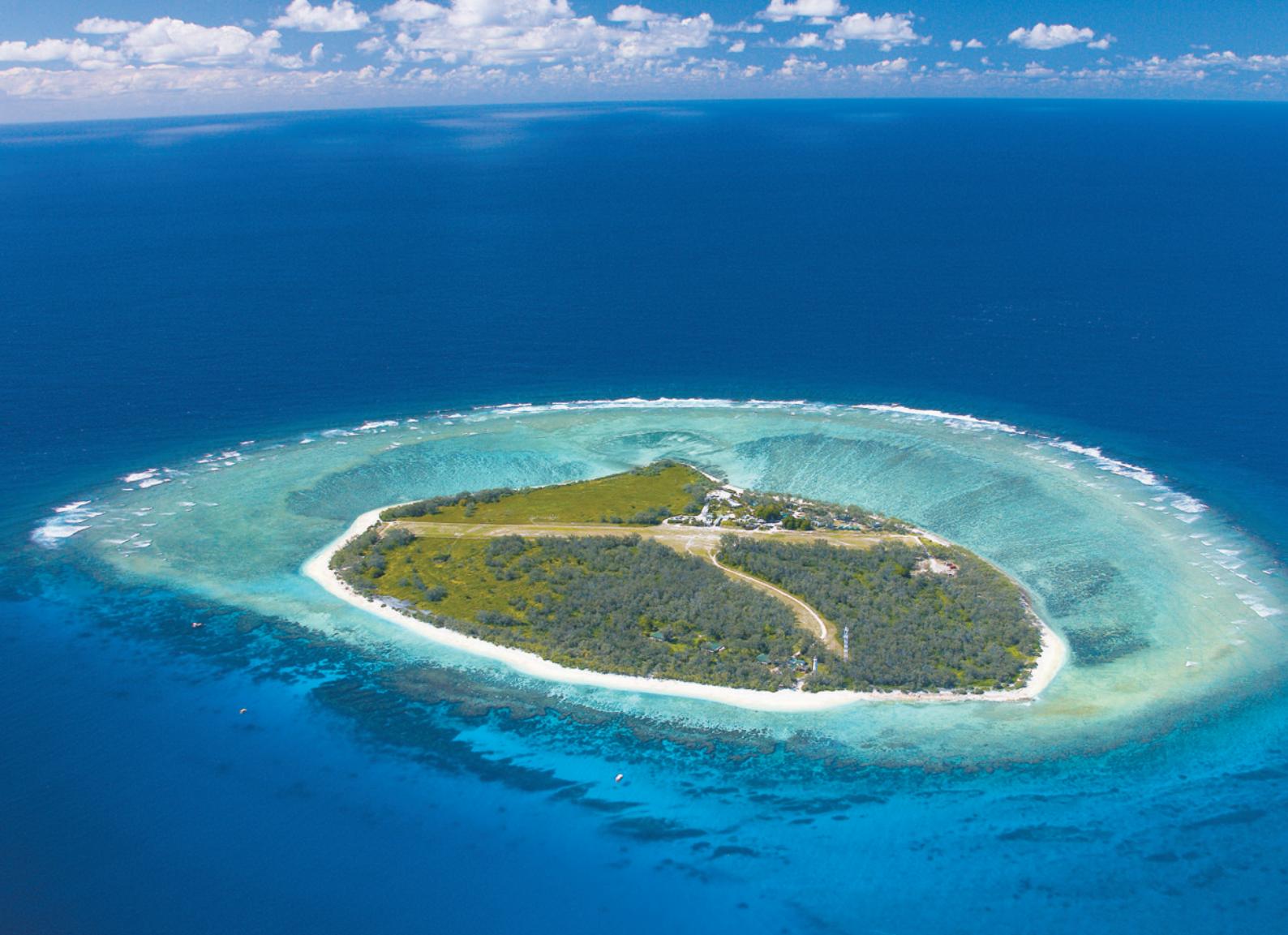
Lady Elliot Island.