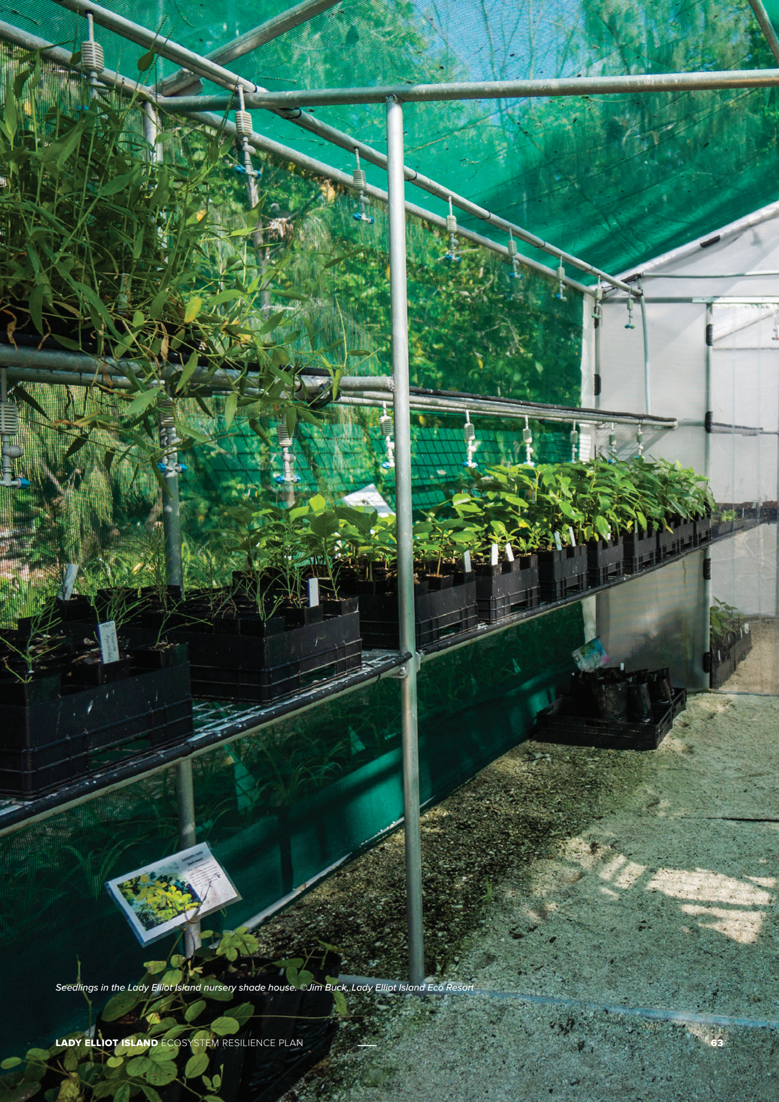
Seedlings in the Lady Elliot Island nursery shade house.