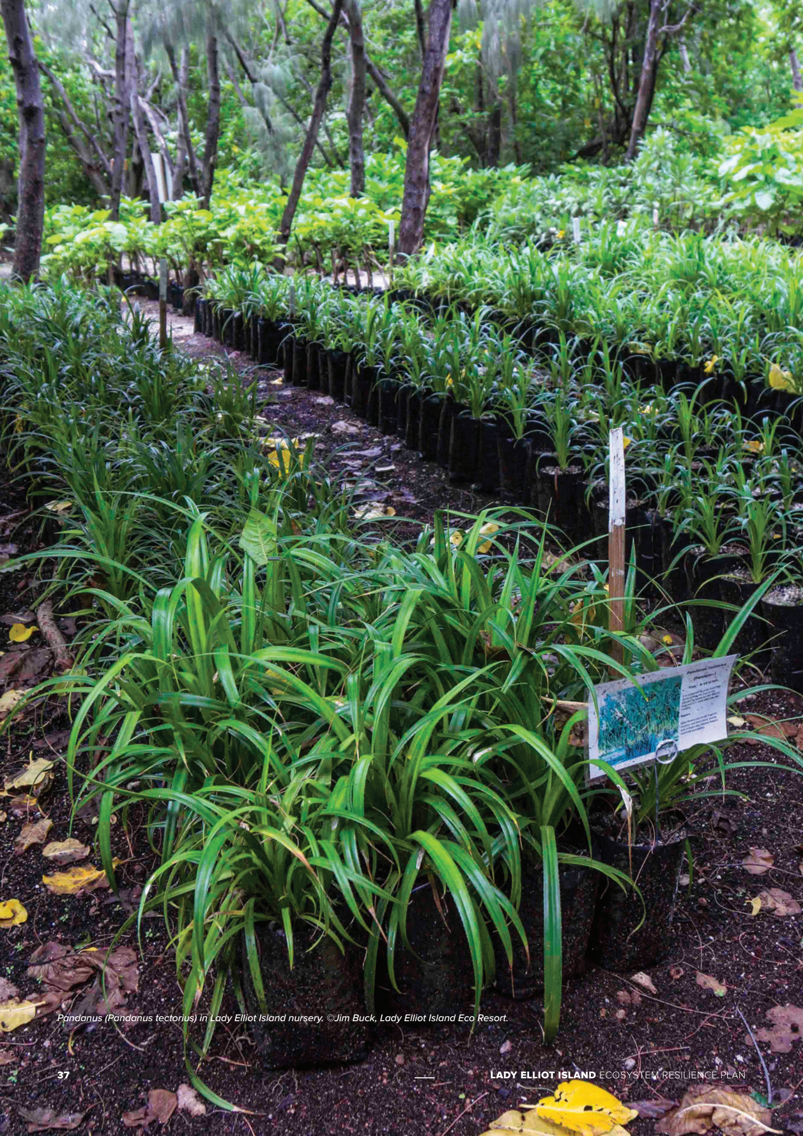
Pandanus (Pandanus tectorius) in Lady Elliot Island nursery.