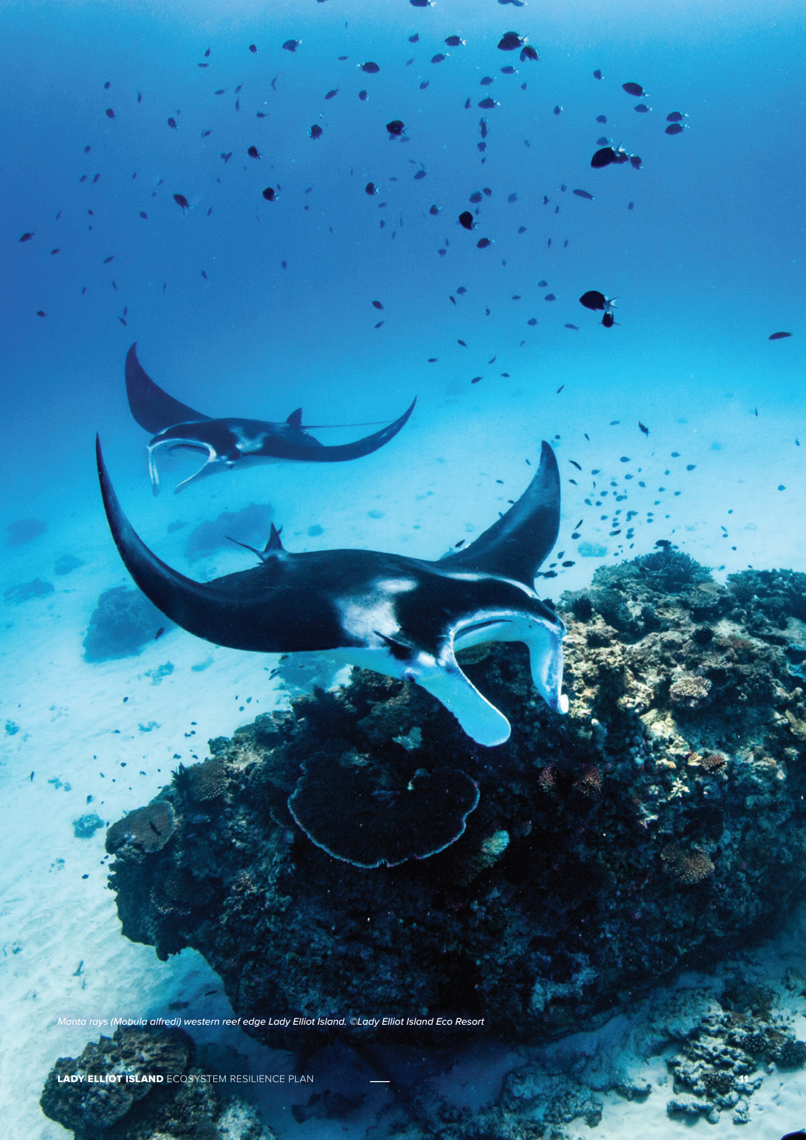
Manta rays (Mobula alfredi) western reef edge Lady Elliot Island.