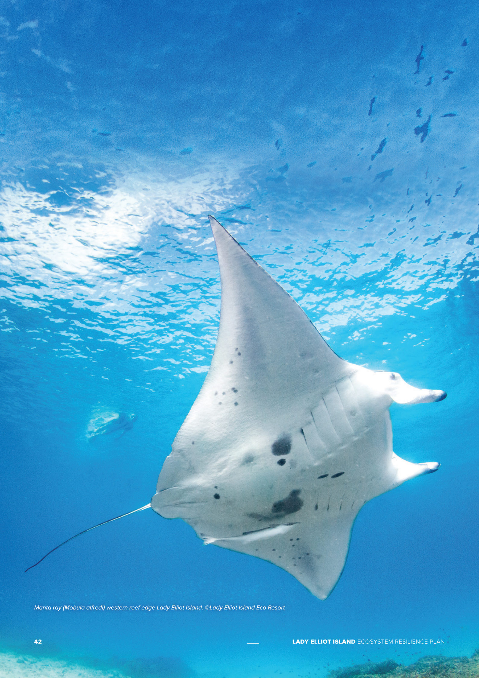
Manta ray (Mobula alfredi) western reef edge Lady Elliot Island.