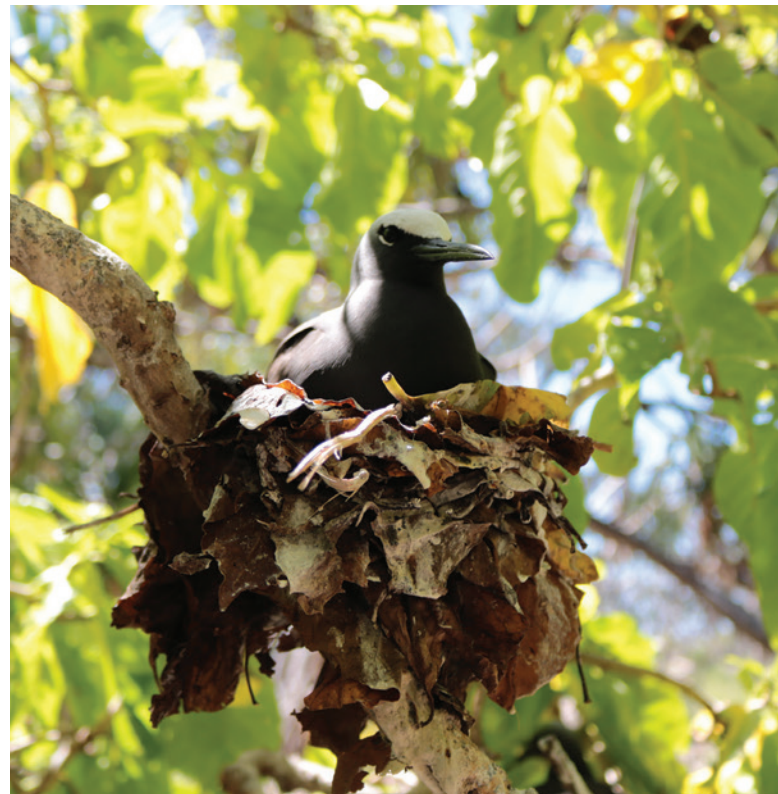
Noddy tern ( Anous minutus ) nesting in pisonia ( Pisonia grandis ).