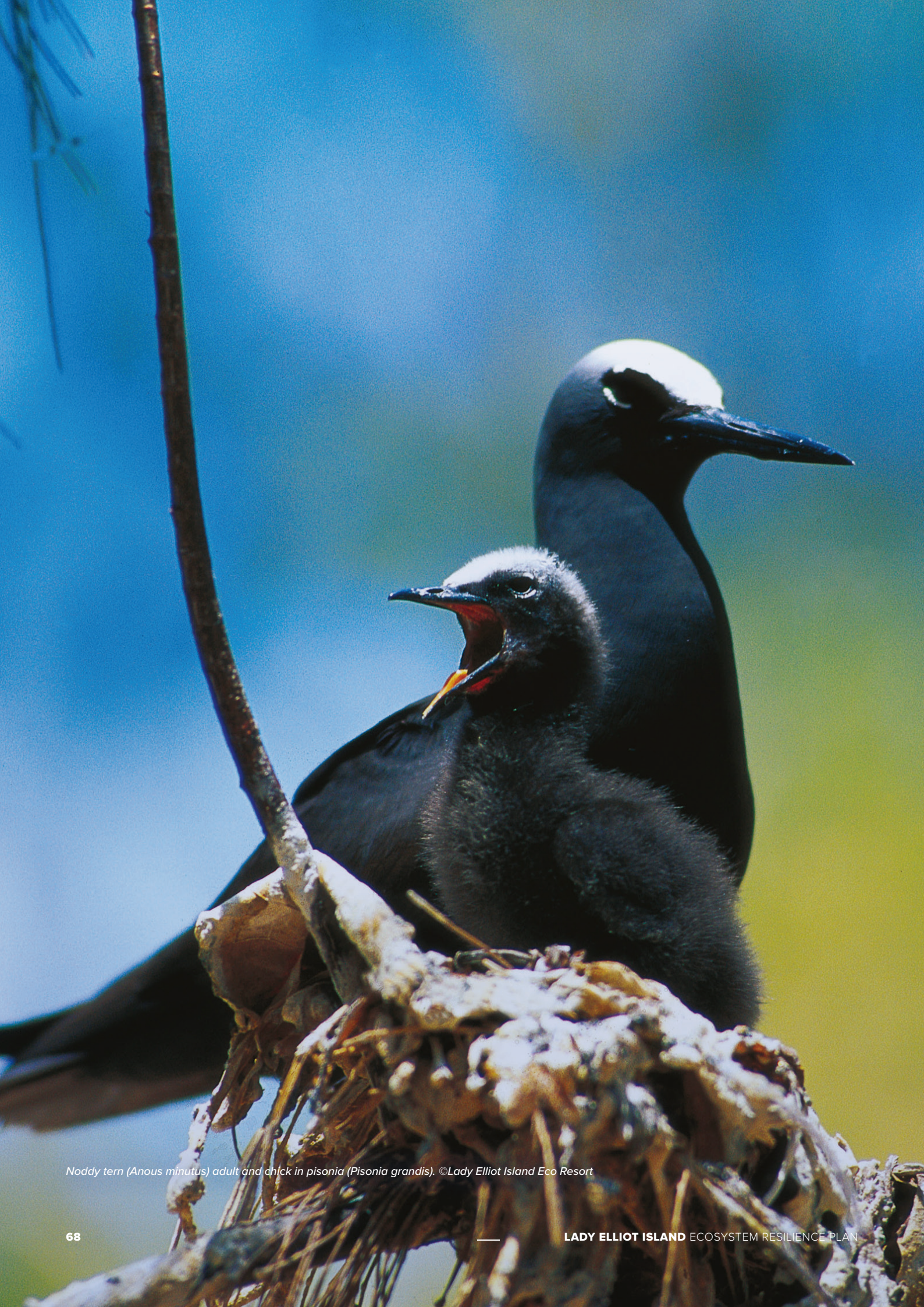
Noddy tern ( Anous minutus ) adult and chick in pisonia ( Pisonia grandis ).