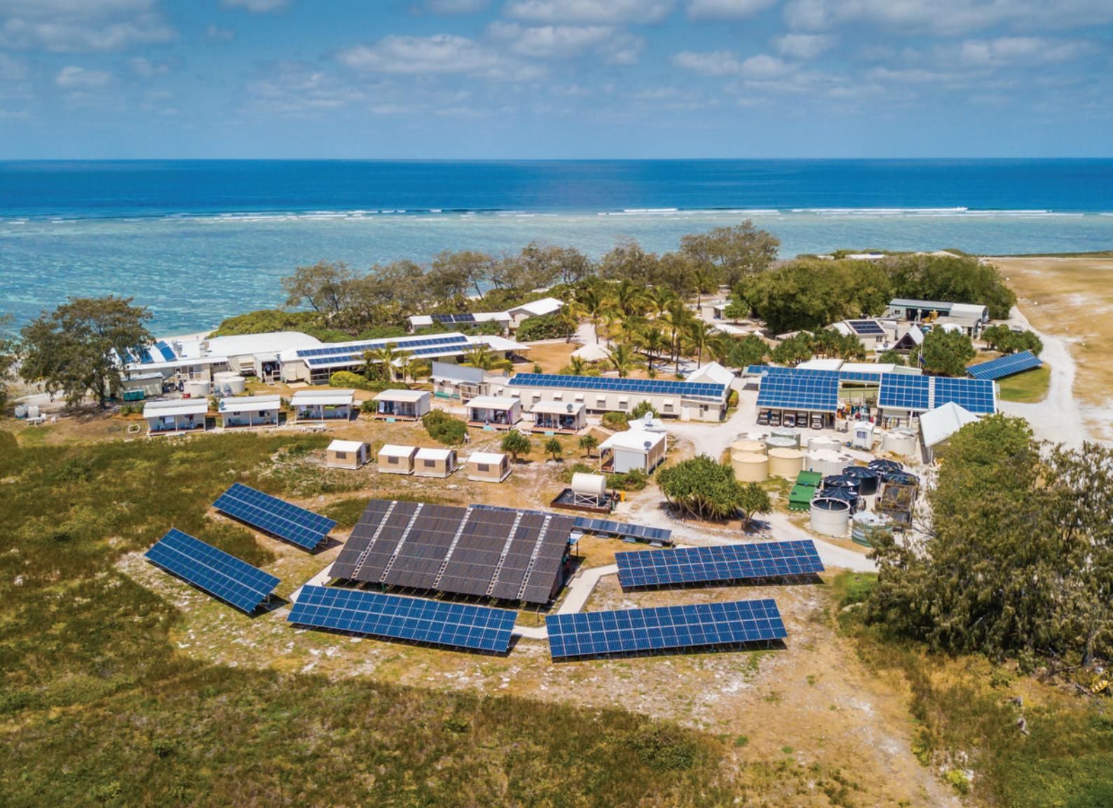
Lady Elliot Island Eco Resort solar power system.