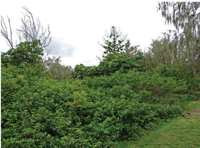
Figure 3: Current vegetation in the South-West Zone. The lantana ( Lantana camara ), pine trees ( Araucaria spp.) and umbrella tree ( Schefflera actinophylla ) to be removed prior to pisonia ( Pisonia grandis ) planting.

Most of the South-West Zone is covered with extensive, impenetrable lantana thickets with a canopy of casuarina of unknown provenance that have spread from past revegetation plantings (Figure 3). These will be replaced by pisonia forest.