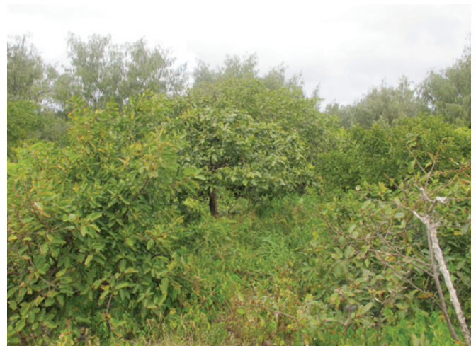
Figure 5: North-West Zone showing sandpaper fig ( Ficus opposita ) already well-established in this area growing among patches of lantana ( Lantana camara ) shrubs and dense ground cover of dwarf poinsettia ( Euphorbia cyathophora ) and other pest plants.

Unwanted tree species to be removed ahead of other pest plants. Coordinate their removal from the entire island in one operation. First pass pest plant removal of other pest plant species to be undertaken in manageable sized areas over a four to five-year period. Regular long-term systematic weeding is required to maintain dominance of native cay species.