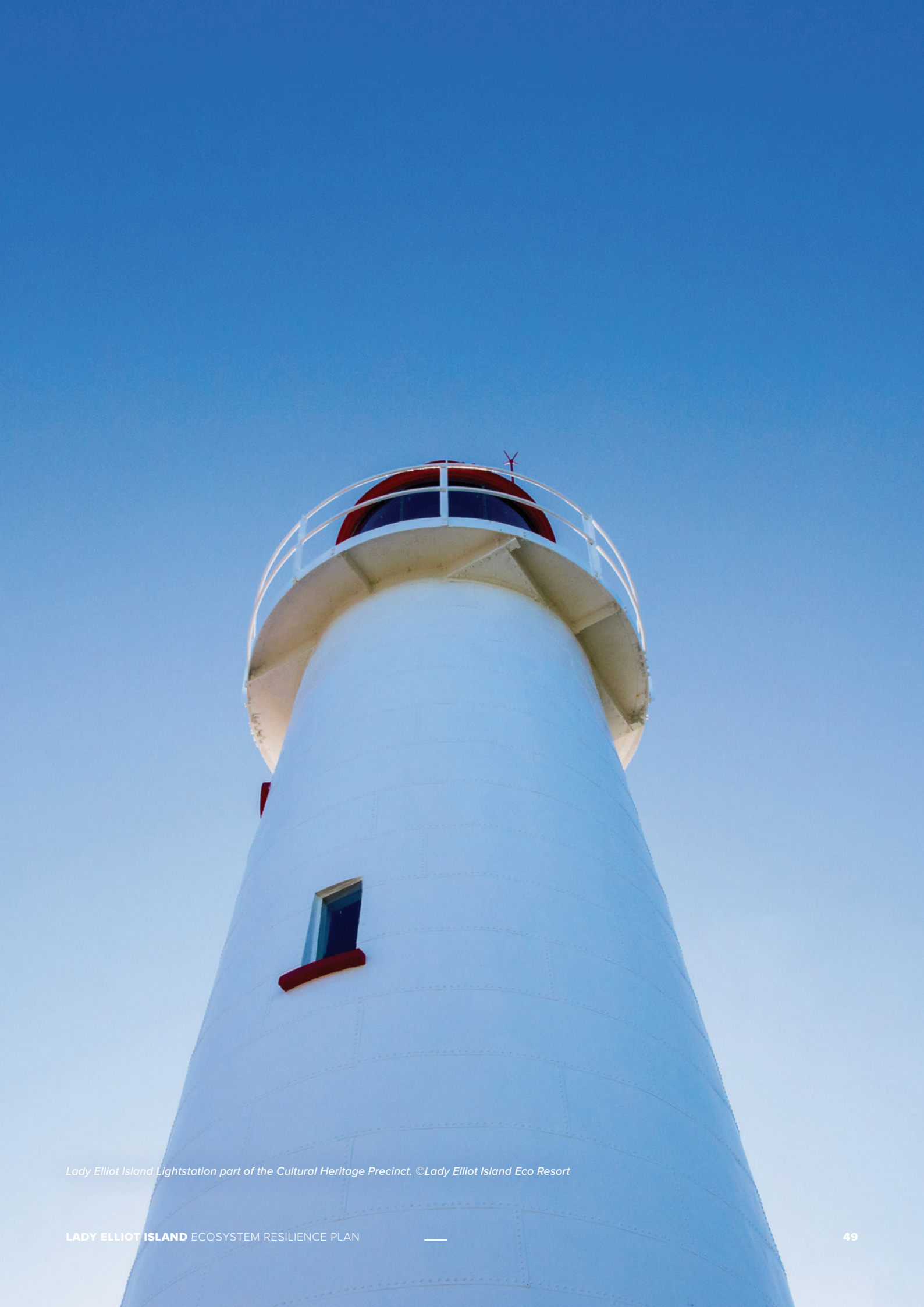
Lady Elliot Island Lightstation part of the Cultural Heritage Precinct.