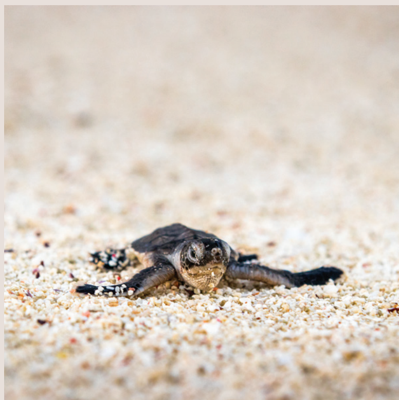
Green turtle hatchling ( Chelonia mydas).

The Great Barrier Reef Marine Park Authority acknowledges the continuing sea country management and custodianship of the Great Barrier Reef by Aboriginal and Torres Strait Islander Traditional Owners, whose rich cultures, heritage values, enduring connections, and shared efforts protect the Reef for future generations. The Great Barrier Reef Marine Park Authority further acknowledges the Port Curtis Coral Coast Traditional Owners of the sea country within lies LEI and their continuing connections to the land and sea country of this region. We pay respect to them, their cultures and their Elders, both past and present.