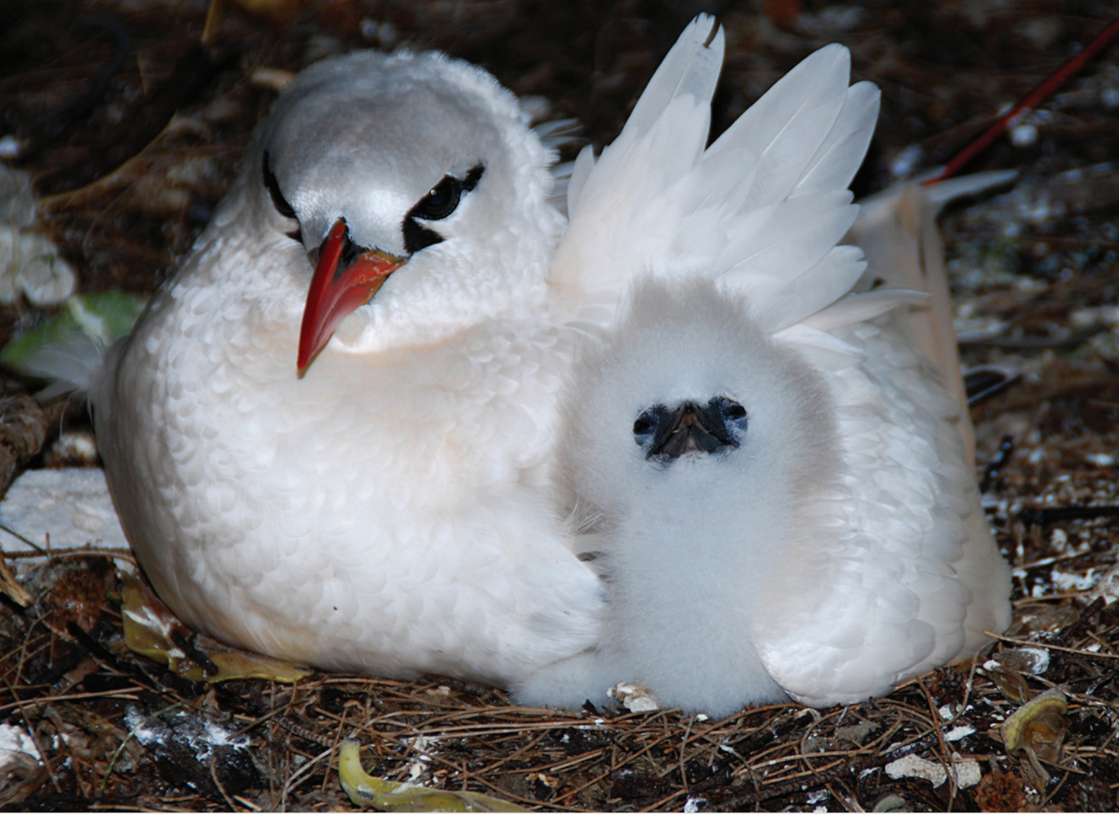
Red-tailed tropic bird ( Phaethon rubricauda ) adult and chick on Lady Elliot Island.