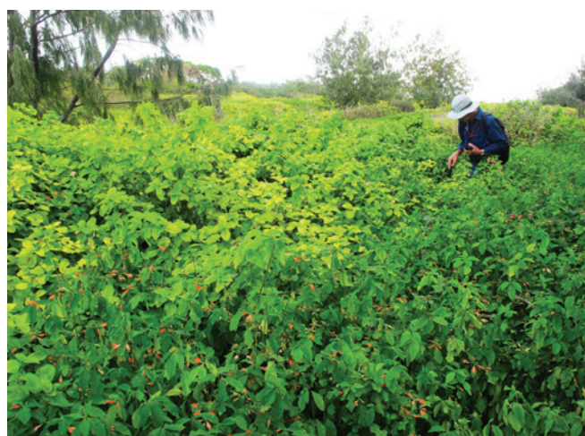
Figure 4: Dense cover of dwarf poinsettia ( Euphorbia cyathophora ) and lantana ( Lantana camara ) in the South-West Zone.

Figure 4 shows a dense cover of dwarf poinsettia ( Euphorbia cyathophora ). It may be necessary to remove these in some areas prior to planting to provide access. Once the planted pisonia is established, there will be no need to carry out further treatment of this or other invasive herbaceous pest plant species such as nightshade ( Solanum nodiflorum ), and cobbler's pegs ( Bidens pilosa ) as they will be completely shaded out once the pisonia canopy closes.