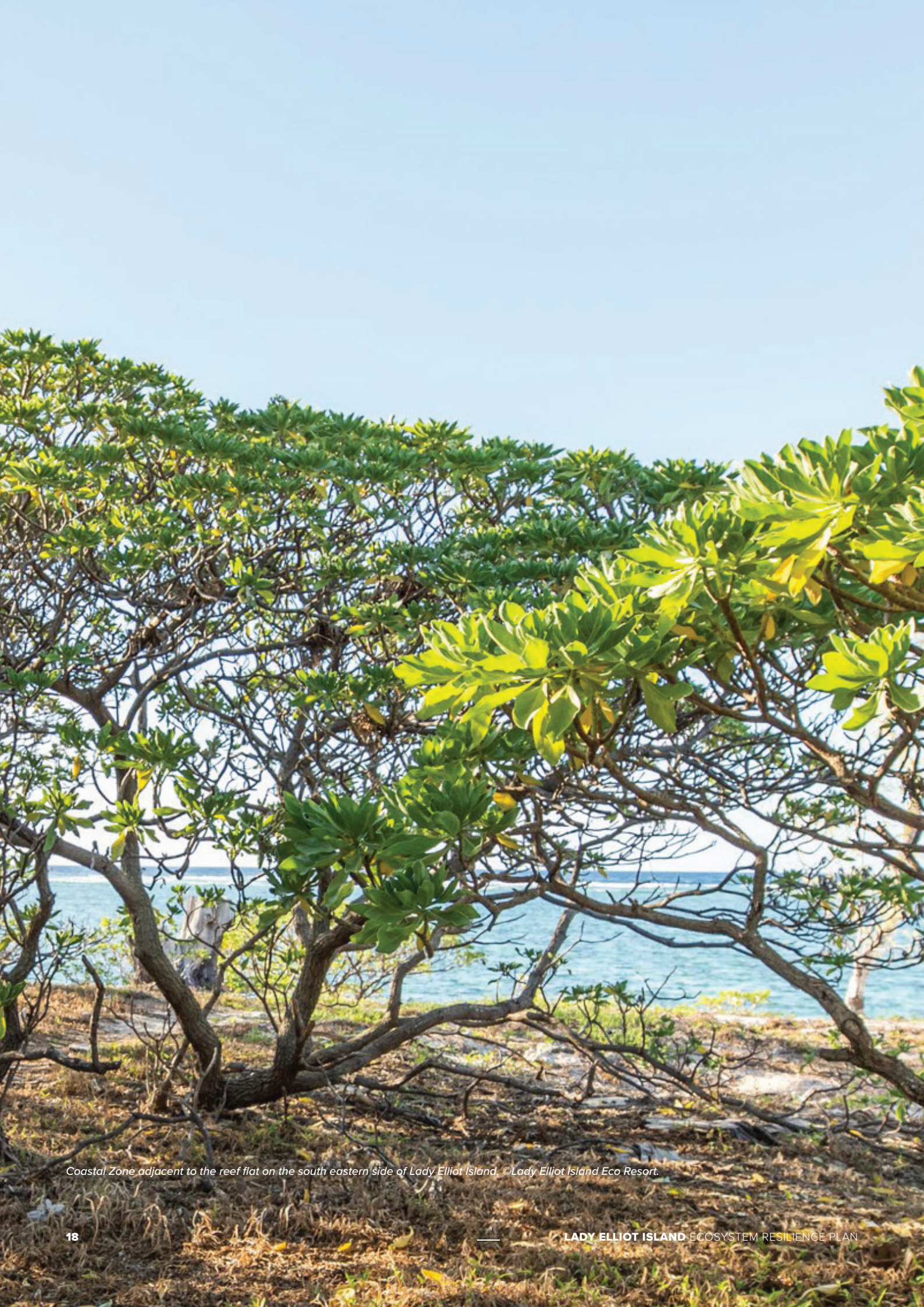
Coastal Zone adjacent to the reef flat on the south eastern side of Lady Elliot Island.