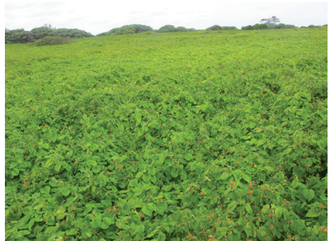
Figure 6: Dense cover of dwarf poinsettia ( Euphorbia cyathophora ) and morning glory ( Ipomoea indica ) in the North-East Zone

Use small-scale indicator trials prior to undertaking pest plant control actions of larger areas to determine the most effective methods of pest plant regrowth control (initially without use of systemic chemicals) as well as best methods to establish native species.