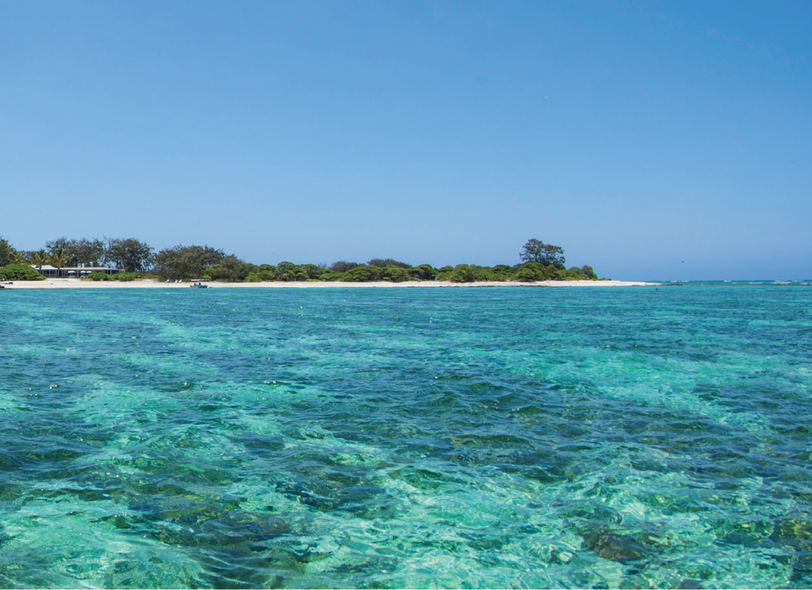
Reef crest Lady Elliot Island.

This will be achieved by implementing the following objectives: