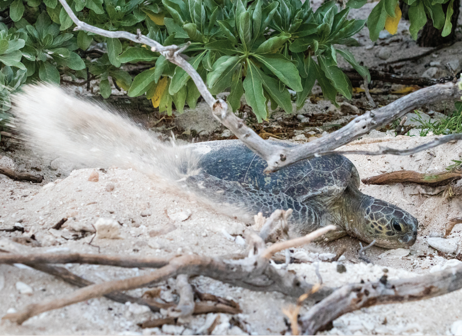
Green turtle nesting ( Chelonia mydas ) in Coastal Zone.