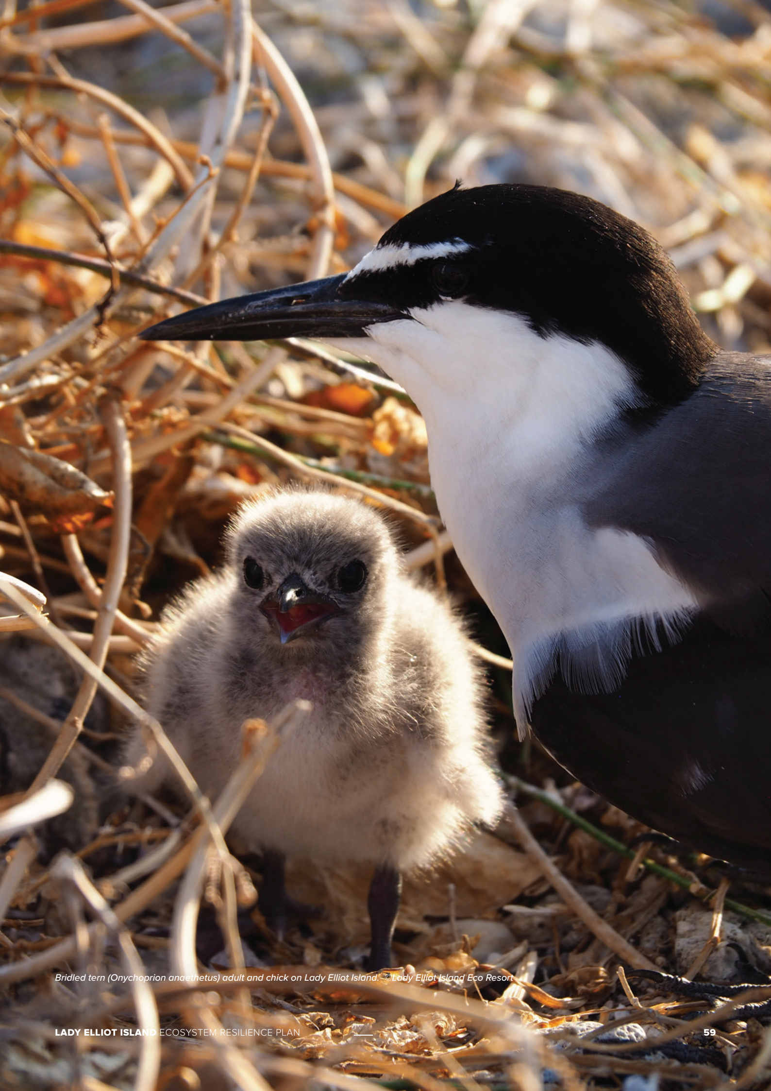
Bridled tern (Onychoprion anaethetus) adult and chick on Lady Elliot Island.