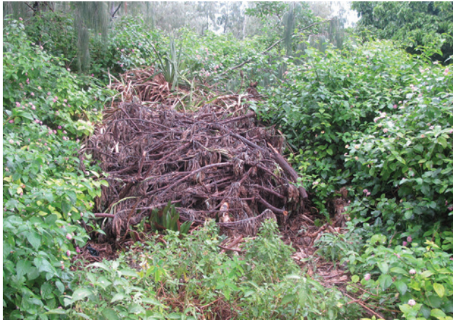
Figure 7: Agave sp. and Moses in the cradle (Tradescantia spathacea) growing in garden waste at the end of a track pushed through the lantana in the South-West Zone