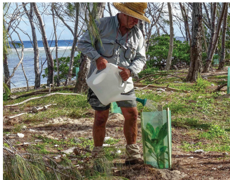
Octopus bush (Argusia argentea) planted in the Coastal Zone.

Ensure that necessary biosecurity measures are implemented to prevent the introduction of new pest plants to LEI and prevent pest plants spreading to other islands either naturally (e.g. by birds and wind) or through human activity (e.g. barges, equipment and people who visit other islands after leaving LEI).