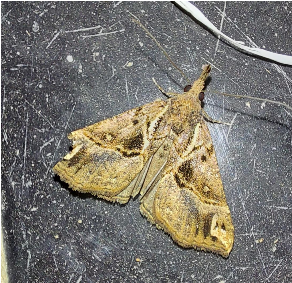
Figure 2 Hypena laceratalis