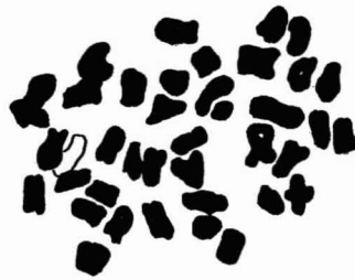
FIG. 6 (left). Meiosis in Pteris novae-caledoniae Hook. n = 58 . \times 1250 . FIG. 7 (right). Tectaria seemanni (Fourn.) Copel. n = 40 . \times 1250 .