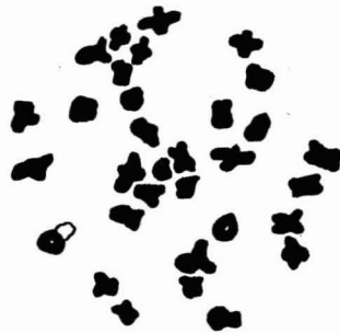
FIG. 8 (left). Meiosis in Cyclosorus invisus (Forst.) Copel. n = 36 . \times 1250 . FIG. 9 (right). Blechnum obtusatum (Labill.) Mett. n = 33 . \times 750 .