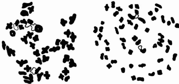
FIG. 4 (left). Meiosis in Lindsaea vieillardii Mett. n = c.47 . \times 1000 . FIG. 5 (right). Pteris ensiformis Burm. n = 58 . \times 1250 .