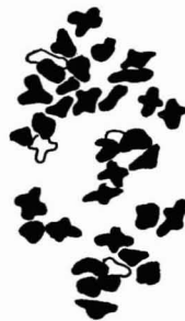
FIG. 10 (left). Meiosis in Blechnum moorei C. Chr. n = 33 . \times 1250 . FIG. 11 (right). Drynaria rigidula Bedd. n = 37 . \times 1250 .