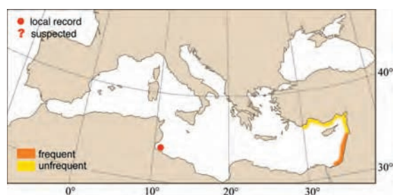
1st Mediterranean record Egypt, 1936 [1933]