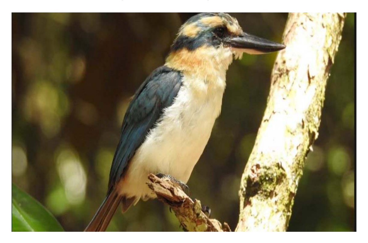
Tangaeo (Mangaia Kingfisher) Te Ipukarea Society