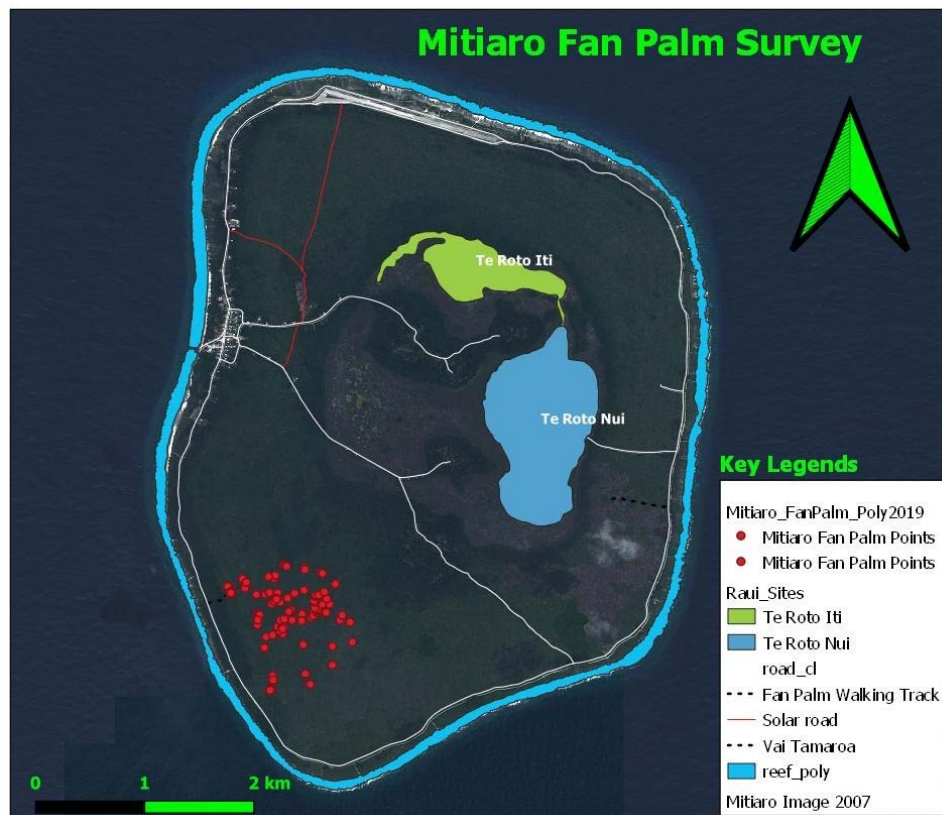
Image 3. The Iniao clusters are confined to the south and south west corner of Mitiaro

On Mitiaro, Pritchardia mitiaroana occurs as scattered, dense colonies, or plots.. The most recent survey was conducted by National Environment Service (NES) in 2019. The palms previously were thought to be restricted to the south west corner of the island. However, the 2019 survey by NES found several plots further south than previously recorded (NES, 2019 unpublished). The difficult terrain in the inland makatea of Mitiaro means that a thorough island wide survey has not yet been undertaken. The picture below shows the current known distribution of the Iniao in Mitiaro.