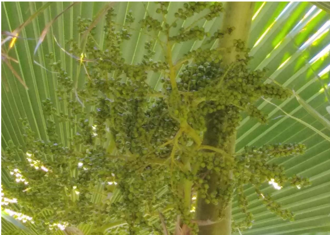
Image 1. Showing Iniao fruits, which become dark as they mature.

According to the “The Flora of the Cook Islands” (Sykes, 2016), the Iniao is a small tree ranging in size from 4 to 6m in height, with a trunk diameter of around 35cm, when mature. The crown of the tree has up to 25 fan shaped fronds and produces fruits of between 5 and 7mm in diameter that become dark brown or black (Sykes, 2016). Other authors suggest that the tree can grow up to 10m in height (eg Hodel 2007)). It has a smooth trunk, moderate to dark gray, with a slight bulge in the middle. It emits a hollow, resonating, drum-like sound when knocked on (Hodel 2007). Underneath these trees there is a thick layer of dead, fallen leaves from the palms (Hodel . 2007). The pictures below show some of the features of the Iniao