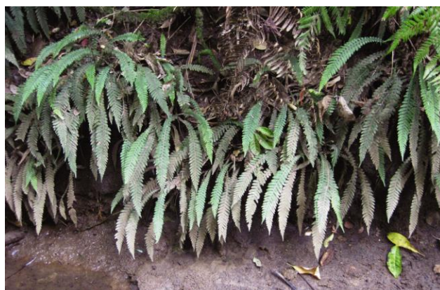
Fig. 11. Austroblechnum lanceolatum , Wairaki Stream Reserve, 30 Nov 2016.