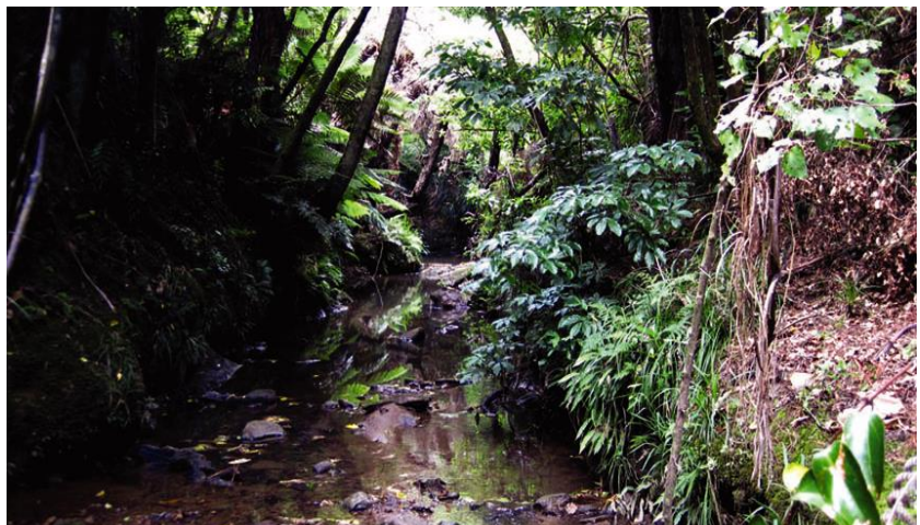
Fig. 9. Wairaki Stream Reserve, below Wanganella Place, 11 Dec 2016.