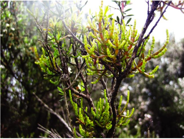
Fig. 6. Korthalsella salicornioides on manuka, Lynfield Cove Reserve, 26 Nov 2016.