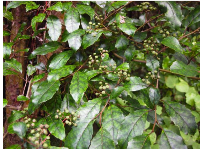
Fig. 7. Putaputaweta ( Carpodetus serratus ) fruiting, Lynfield Cove Reserve, 11 Feb 2017.

the rushes Juncus effusus and Juncus planifolius . A prominent plant here is putaputaweta ( Carpodetus serratus ), with several adult trees and numerous seedlings and saplings (Fig. 7). There is also a fair amount of kiokio. Where the creek opens out on to the cliff top there are groves of umbrella sedge ( Cyperus ustulatus ) and Machaerina sinclairii , the latter also found locally below the cliffs, close to the sea (Fig. 8).