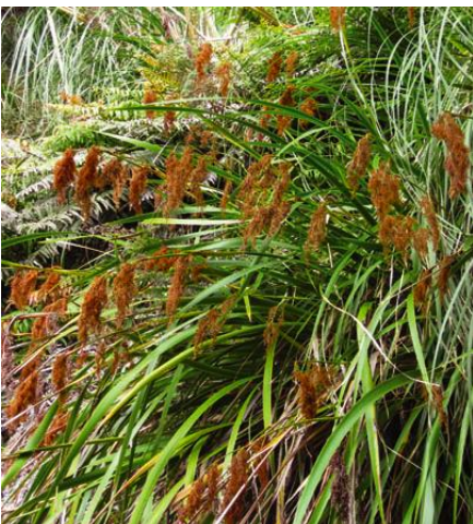
Fig. 8. Machaerina sinclairii , Lynfield Cove, 29 Nov 2016.

The coast line in Flounder Bay (the central cove of Blockhouse Bay) has a small area of mangroves ( Avicennia marina ) with an adjoining salt meadow fringe of Apodasmia similis , and Isolepis cernua . Particularly where there is fresh water seepage, the sedge Machaerina sinclairii is abundant, and with it