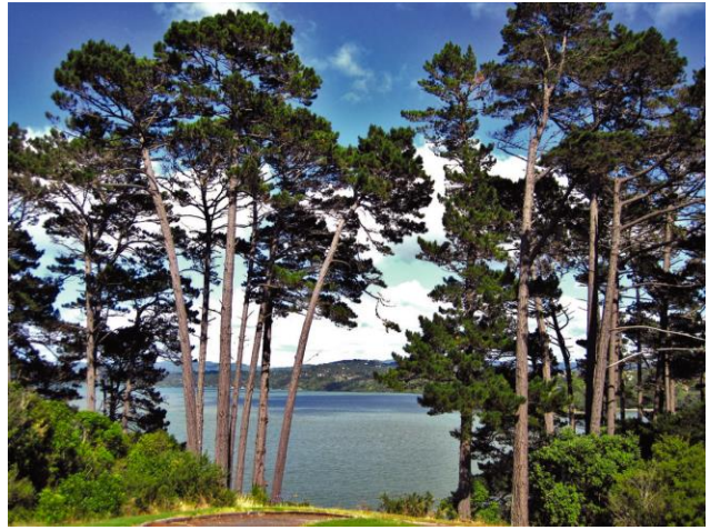
Fig. 5. Monterey pines ( Pinus radiata ), Himalaya Reserve, 11 Feb 2017.

The approach to this 3.33 ha coastal reserve from the end of Fairsea Place off Himalaya Crescent gives a dramatic vista to the Manukau Harbour,