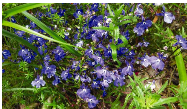
Fig. 12. Lobelia erinus , Alaunia Place entrance, Wairaki Stream Reserve, 11 Dec 2016.