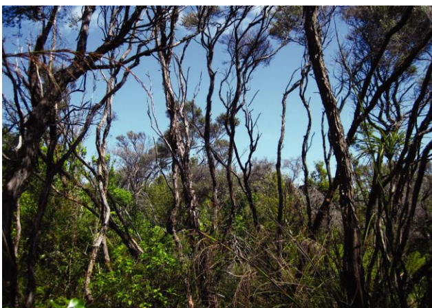
Fig. 2. Leptospermum scoparium forest, Manukau South Domain, 3 Dec 2016.

teretifolia , Schoenus tendo and Tetraria capillaris . Bracken ( Pteridium esculentum ) and tangle fern ( Gleichenia dicarpa ) are present. The parasite Korthalsella salicornioides (Cameron 2001) occurs on manuka (reputedly planted with stock from a Taupo native plant nursery, Steve Benham, pers. comm.) on the grassed margin. Invasive Hakea salicifolia trees have been destroyed. On the grassy edge of the gumland scrub can be found Aira caryophyllea , Danthonia decumbens , Eragrostis brownii , Rytidosperma biannulare , Schoenus apogon , Thelymitra pauciflora (Fig. 3), Vulpia myuros and