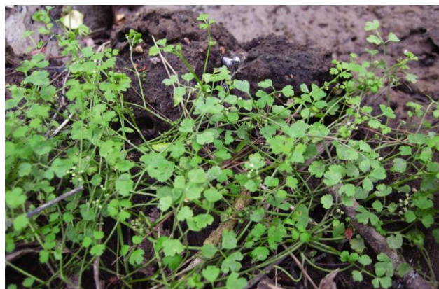
Fig. 10. Apium prostratum "white denticles", Wairaki Stream Reserve, 29 Nov 2016.

North of Wairaki Stream there is a 2.21 ha area of privately owned bush on the Tropicana property, formerly belonging to Bill Subritzky, and now owned by Ryman Health Care. The Lynfield Retirement Village is being built there on adjoining open land. Once the main Wairaki Stream is crossed, the best bush occupies the south-facing slopes where grows tanekaha, rimu ( Dacrydium cupressinum ), miro, towai ( Weinmannia sylvicola ), kowhai, Alseuosmia macrophylla , Coprosma grandifolia , akepiro, Pseudopanax arboreus and kiekie ( Freycinetia banksii ). There is a noteworthy presence of the filmy fern Hymenophyllum demissum , not recorded elsewhere in the Manukau coastal forests, and abundant Carex banksiana .