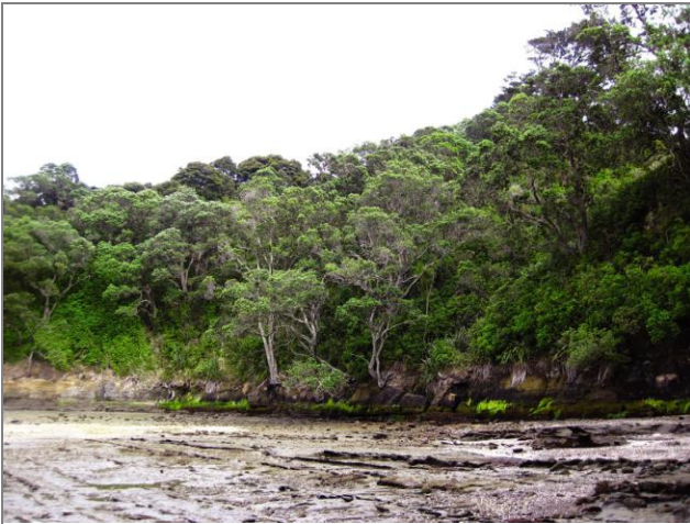
Fig. 4. Halsey Esplanade shoreline, 31 Jan 2017.

several seasonal exotic plants such as Aristea ecklonii , Centaurium erythraea , Isolepis levynsiana , Leontodon saxatilis and Romulea rosea . The moss Kindbergia praelonga abounds in the open grassy area.