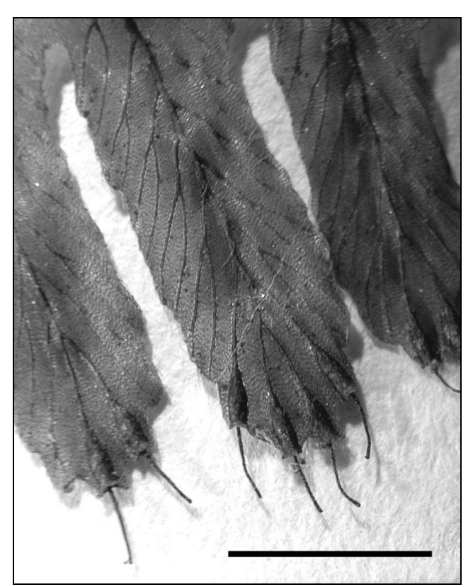
Fig. 2. Fertile pinnules of Trichomanes crispum (AK 111500), Brazil. Scalebar = 5 mm.

Linnaeus is said to have been lax in his Greek studies as a schoolboy, so we might think it just a coincidence that the second part of the generic can also be interpreted using the rather obscure Greek word "manes a kind of cup or beaker". Whether deliberate or not, the generic is apt and memorable.