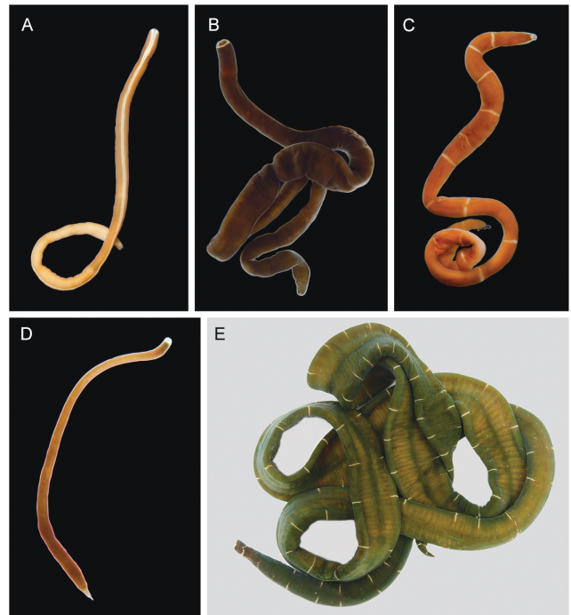
Fig. 2. Live habitus of selected specimens. (A) Lineus bilineatus (Renier, 1804). (B) Lineus grubei (Hubrecht, 1879). (C) Micrura fasciolata Ehrenberg, 1831. (D) Micrura purpurea (Dalyell, 1853). (E) NotospERMUS geniculatus (Delle Chiaje, 1828).

Additional new records. This species has also been recorded in Cape Vilán, Camariñas, A Coruña, Spain (AN11454).