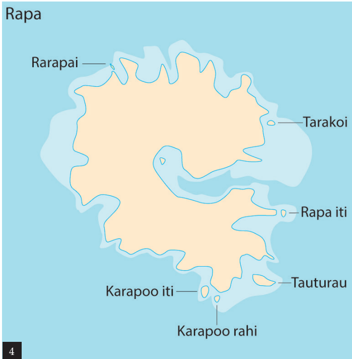
Figures 1–2. Rapa Island, Austral Islands, French Polynesia, December 2019 (Tubenoses Project, © H. Shirihai)