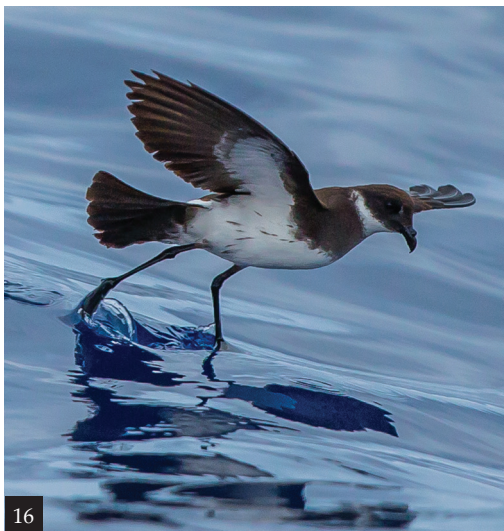
Figures 14–16. Polynesian Storm Petrels Nesofregatta fuliginosa , Rapa Island, Austral Islands, French Polynesia, December 2019. Unique ‘bicoloured’ plumage, with a blackish-brown hood and broad dark breast-band separated by a white ‘cut-throat’, narrow white crescent on the tail base, and pale wingbar tipped with buff. We noted two main variations. Some show sparse and narrow dark streaks on the otherwise white body-sides (Figs. 15–16). The number of underwing greater primary-coverts that are dark with white fringes varies from the four outermost (Fig. 15) to all of them (Fig. 16), but in the latter case on the innermost coverts the dark area is paler and the white fringes broader.