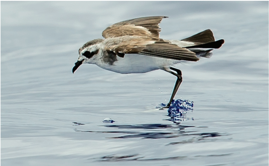
Figure 6. White-faced Storm Petrel Pelagodroma marina , off Rapa, Austral Islands, French Polynesia, December 2019; note combination of sullied pale greyish rump, moderately developed dark breast-side patches, and clean white underparts

of Rapa / Marotiri in September 2006, and a live bird and a dead individual on Rurutu Island in October 2010 (Thibault & Cibois 2017). Seven more records (of ten individuals) are available from across East Polynesia, including an undated sighting for the Line Islands (Thibault & Cibois 2017).