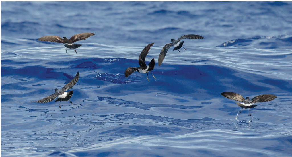
Figure 5. Two Polynesian Storm Petrels Nesofregatta fuliginosa (top and centre left) and three 'classic' Titan Storm Petrels Fregatta [grallaria] titan , Rapa Island, Austral Islands, French Polynesia, November 2019, showing the exceptionally large size of titan relative to other Fregatta , and approaching that of the particularly large Rapa form of N. fuliginosa

Petrels Nesofregatta fuliginosa (Fig. 5). On 24 October, two were seen when approaching Marotiri from the north-east, two were attracted to chum in calm conditions in five hours close to Marotiri and, on departure towards Rapa, four were attracted to the yacht's stern using a fish oil drip. However, c. 60 came to chum there on 24 November. Off Rapa observed throughout the survey period, with max. daily counts in each month involving c. 90 on 25 October, 120 on 12 November, and >100 on 3 December.