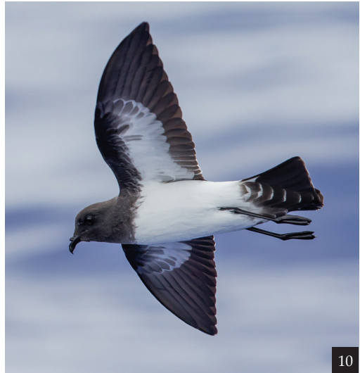
Figures 7–10. ‘Classic’ Titan Storm Petrels Fregetta [grallaria] titan , Rapa Island, Austral Islands, French Polynesia, November–December 2019. The plumage of ‘classic’ titan includes broad white fringes to the scapulars, mantle to rump, and upperwing greater, median and longest lesser secondary-coverts. Fig. 7 offers a closer look at the broad white fringes to the mantle to rump feathers, which are abraded and worn off on a few old, browner feathers. The bird in Fig. 8 has undergone head and body moult, with blackish-grey scapulars and mantle to rump, strongly contrasting with the mainly old, browner upperwing-coverts without white fringes. Note the sparse dark streaking on the body-sides in Fig. 8, but lacking in Fig. 10.

occur/s in East Polynesia away from Rapa and Marotiri, but Titan Storm Petrel apparently disperses a significant distance given these two records from much further north and east.