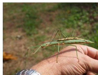
Photo 2. Male and female stick insect, Graeffea crouanii .