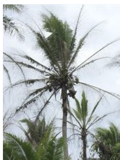
Photo 5. Close up coconut palm attacked by the stick insect, Graeffea crouanii . Note that the palm is recovering from the attack.