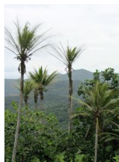
Photo 3. The stick insects, Graeffea crouanii , have stripped the coconut fronds leaving only the midribs.