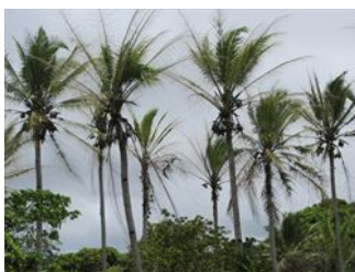
Photo 4. Group of coconuts attacked by the stick insect, Graeffea crouanii .