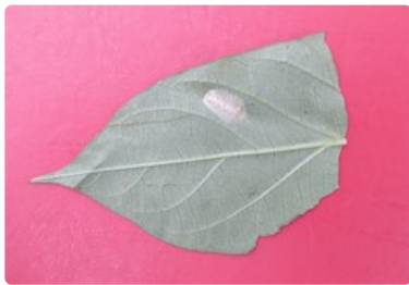
Photo 3. Eggs of coconut flat moth, Agonoxena argaula , on the underside of a sweet potato leaf.