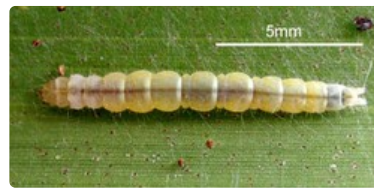
Photo 4. Caterpillar, coconut flat moth, Agonoxena argaula .