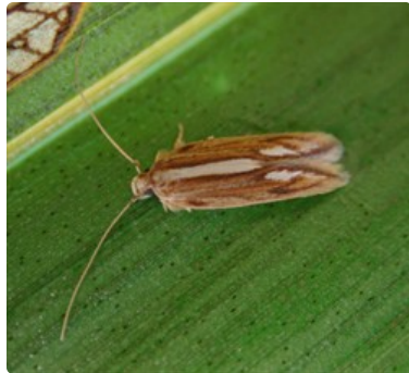
Photo 1. Male adult, coconut flat moth, Agonoxena argaula .