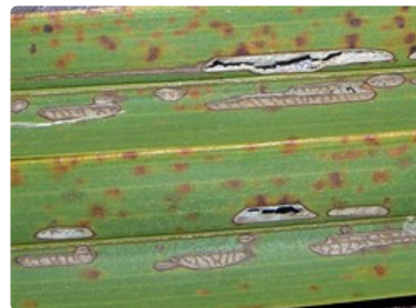
Photo 6. "Windows" in coconut leaflets caused by the feeding of the coconut flat moth, Agonoxena species. The caterpillar has chewed the surface of the leaf, leaving the small veins (probably, Agonoxena pyrogramma , Solomon Islands).