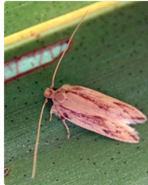
Photo 2. Female adult, coconut flat moth, Agonoxena argaula .