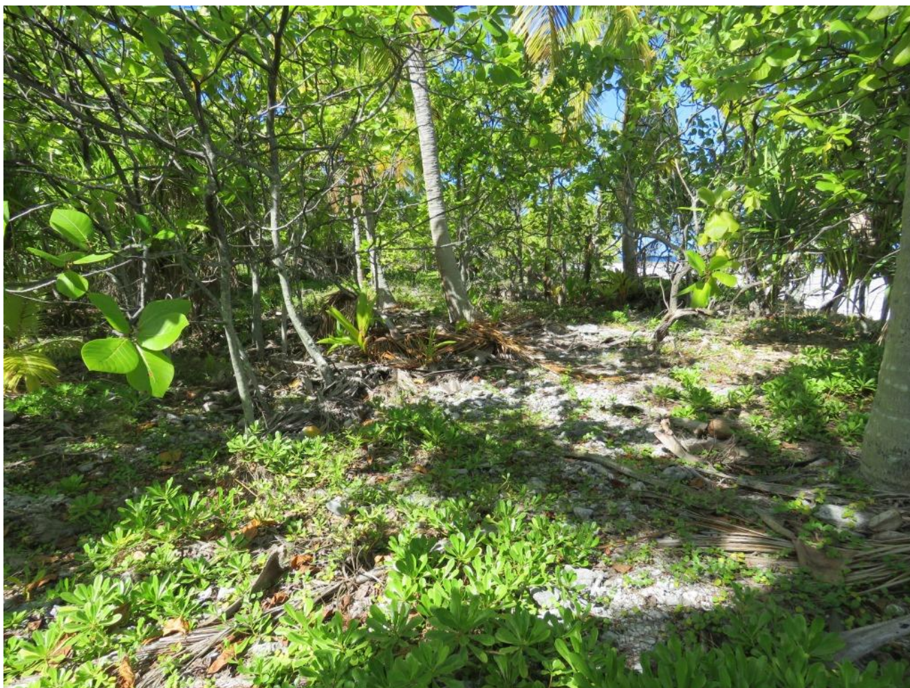
Fig 4.1 – Ideal understorey for Tuttururu on Tenararo comprising fairly open, sandy habitat with a variety of shrubs and grasses.

inhibited the growth and reproduction of essential understorey plants.