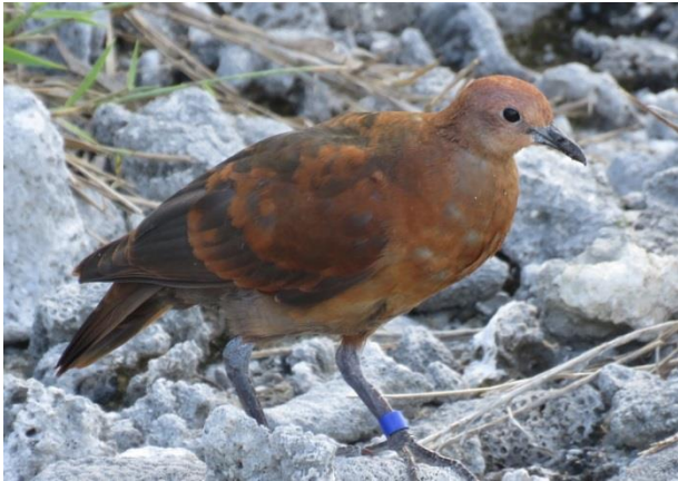
Fig 3.1C – Female (“Young Blue”) at Tenararo on 21 June one week after her capture on Vahanga and subsequent release at Tenararo (L)

The habitat in which Tukururu were found on Vahanga was atypical of the coconut-dominant habitat that prevails there. We found Tukururu to favour more open shrubland habitats with open sand and prostrate vegetation. A key foraging plant at the time of our visit was Achyranthes aspersa , from which Tukururu took fruit and insects. Favored habitats were as follows: