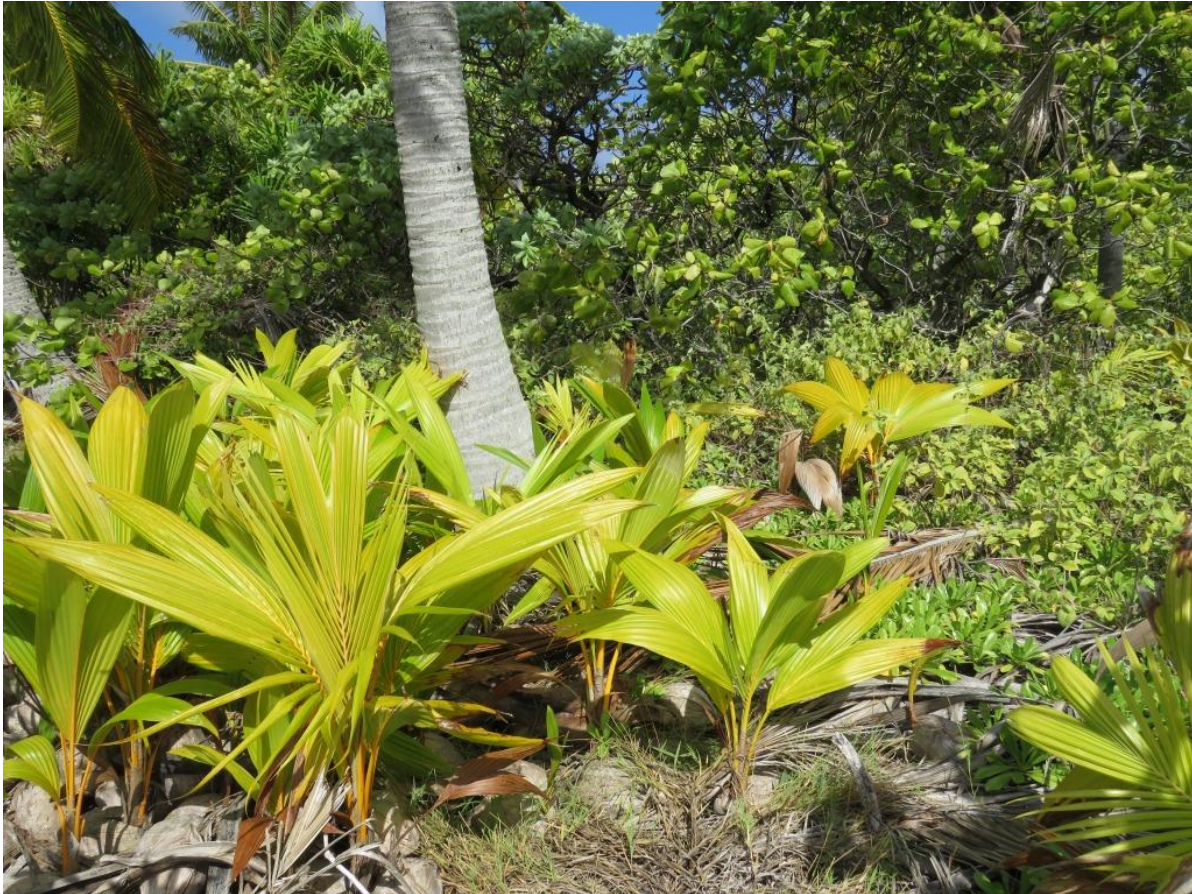
Fig 4.2 – Regenerating coconuts beginning to suppress Achyranthes and other plants at Tenararo.

spread of invasive ants in the Tuamotu-Gambier, the current spread of Avian pox in Society archipelago plus the lack of controls over landing parties. All threats are being addressed via a Species Action Plan and Recovery Plan (CB, RP in prep). For example, coconut regeneration could readily be managed on key motu at Tenararo and Vahanga.