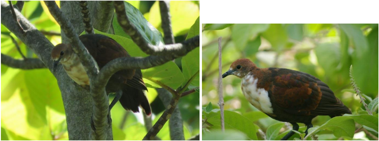
Fig 3.1A – Subadult male at Motu 8 on 7-8 June 2015 (Left) and same individual at Motu 1 24-26 June (Right)