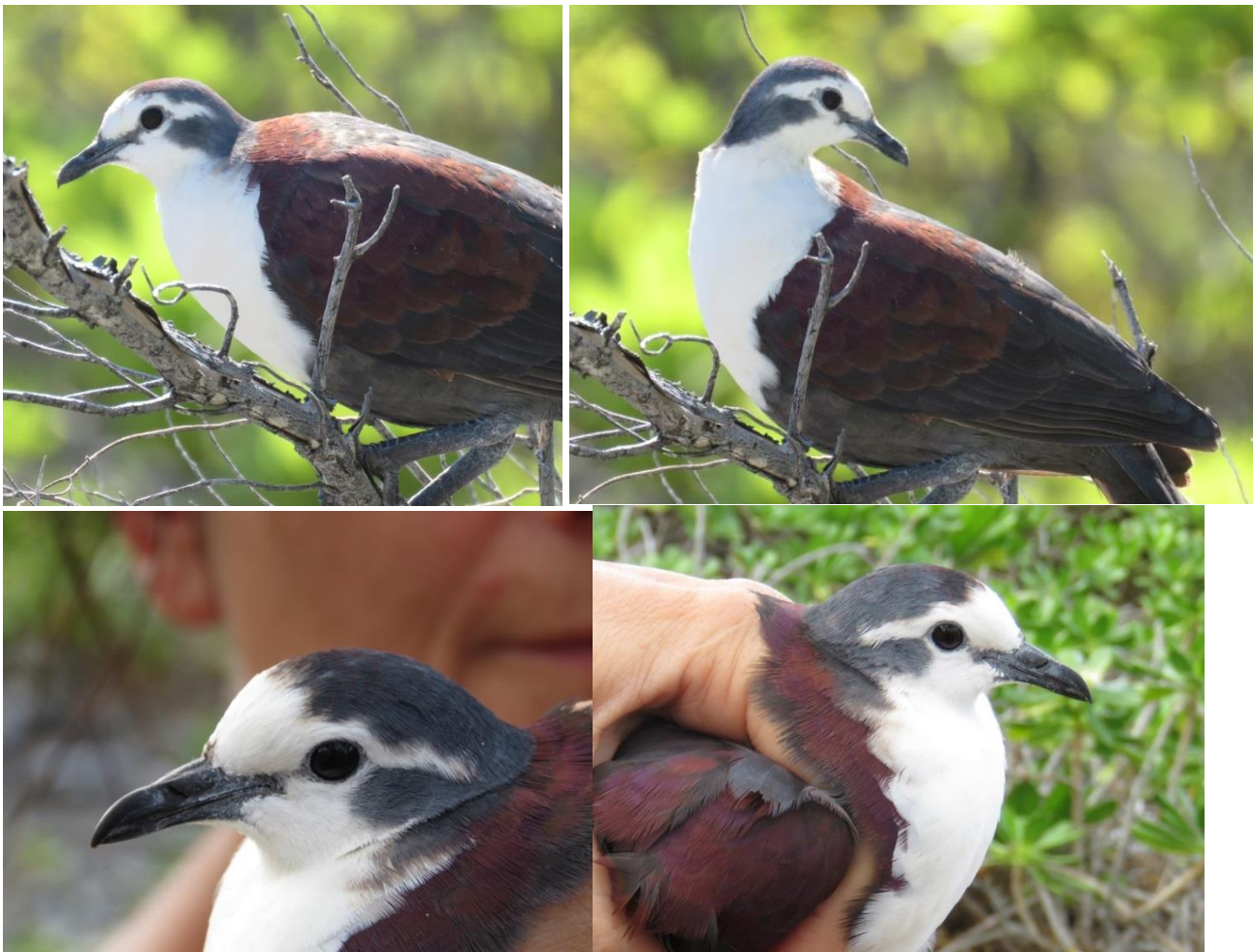
Fig 3.1B – Adult male seen near Titi Hoa 1 on 11 June (L x 2) and a different individual captured at Church Village on 12 March (R x 2) distinguished by several different facial markings.