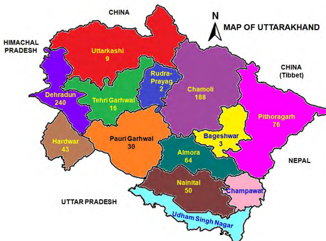
Fig. 2 Number of species of spiders described/recorded from different districts of Uttarakhand.

125 species belonging to 49 genera under 17 families in Uttarakhand. Later, Uniyal et al. (2011) recorded 88 species of spiders in Nanda Devi Biosphere Reserve situated in the Chamoli district. After one year, Gupta and Siliwal (2012) prepared a checklist of spiders of Wildlife Institute of India campus, Dehradun district of Uttarakhand. In recent years, Pooja et al. (2019) and Siddhu et al. (2020) recorded 31 and 27 species of spiders from Navdanya Biodiversity Farm located in Dehradun district and Nainital district of Uttarakhand, respectively. However, most of the national parks and sanctuaries, forest areas, agricultural fields of the states still await intensive and extensive survey programmes to record these spiders.