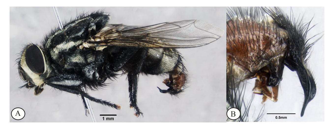
Figure 2. Peckia (Peckia) villegasi Dodge, 1966. A: Habitus, male. B: Male terminalia.

for the first time for the northeastern region of Brazil (Table 1). Most Sarcophagidae species were collected on both types of bait, chicken and sardine. P. villegasi occurred on both substrates.